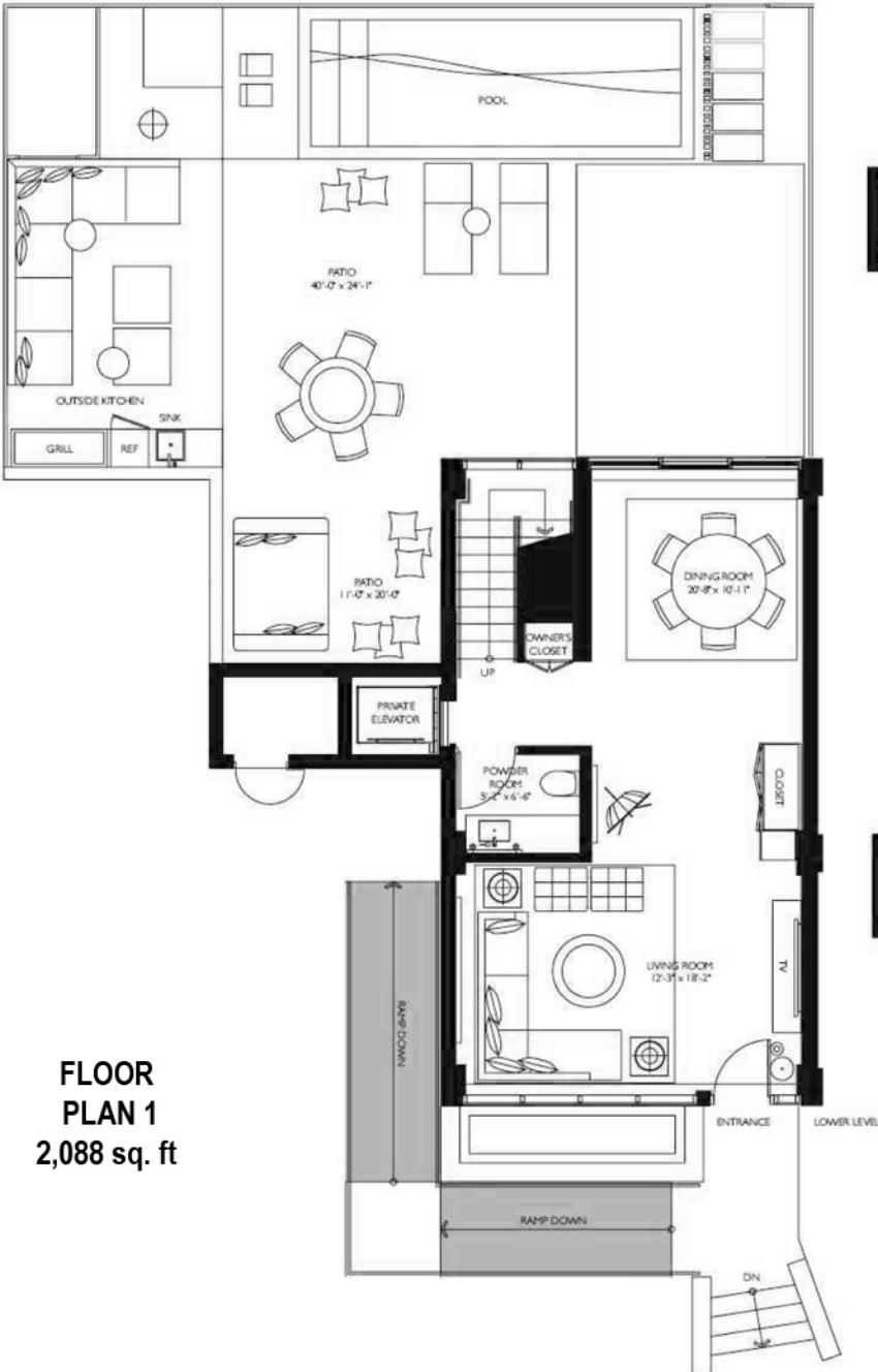
FLOOR PLAN 1 2,088 sq. ft