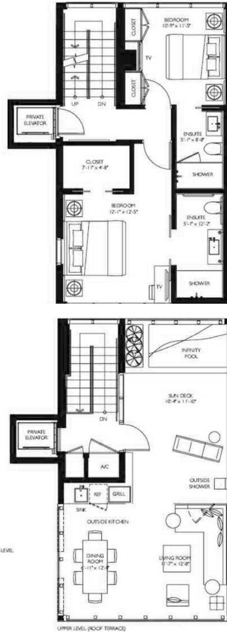
UPPER LEVEL (ROOF TERRACE)