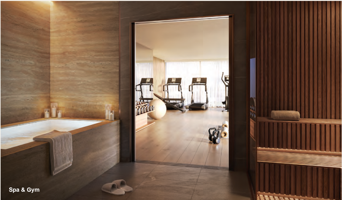
Spa & Gym