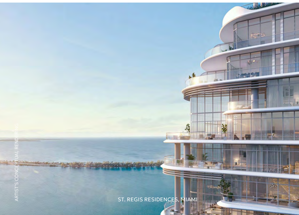
ST. REGIS RESIDENCES, MIAMI

SEE FULL LEGAL DISCLAIMERS ON THE INSIDE BACK COVER OF THIS BROCHURE.