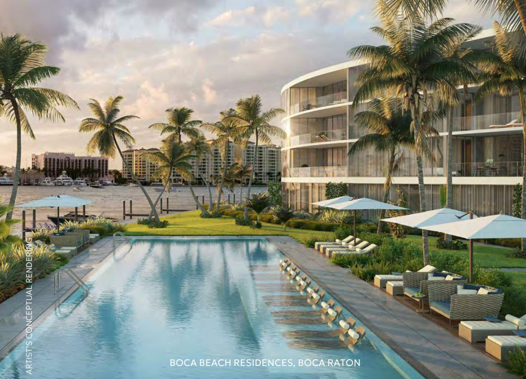
BOCA BEACH RESIDENCES, BOCA RATON