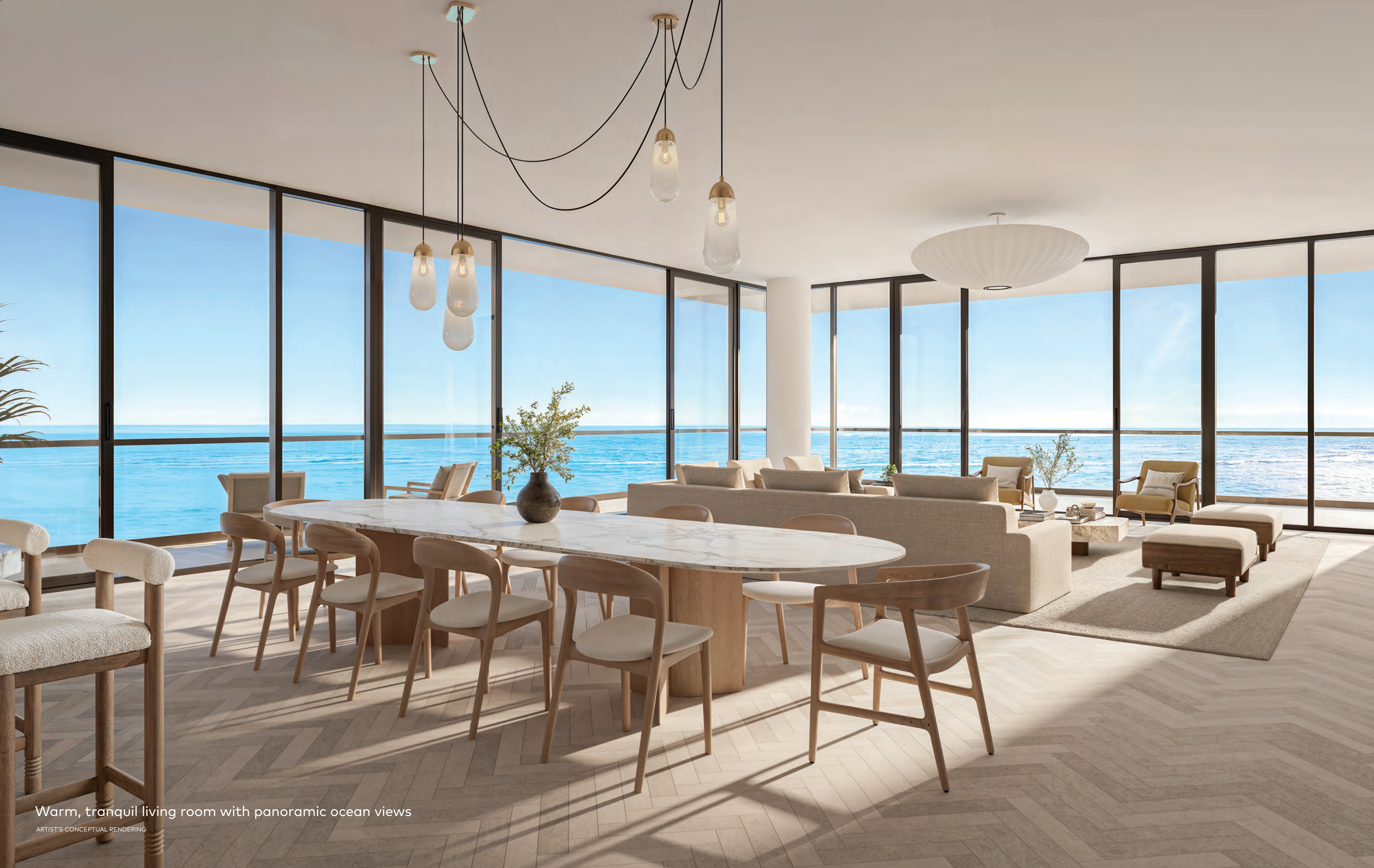
Warm, tranquil living room with panoramic ocean views