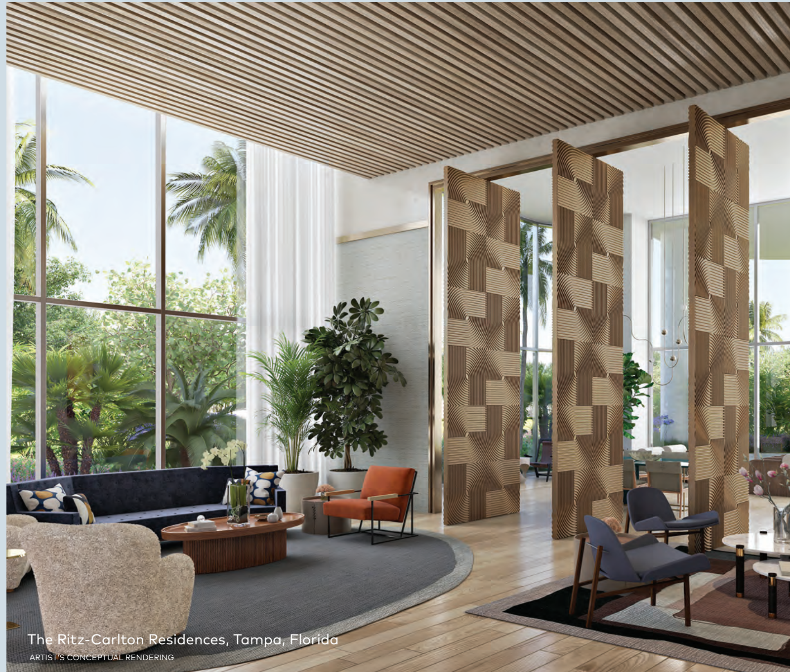
The Ritz-Carlton Residences, Tampa, Florida ARTIST'S CONCEPTUAL RENDERING

For over twenty years, the studio has become a definitive fixture in the design world, winning numerous industry awards and designing on behalf of luxury brands and elite clients across the globe. Meyer Davis believes that great design works on multiple levels, weaving together bold design moves and striking details to ensure that each project makes an immediate and lasting impact. Recent projects include the storied Rosewood Little Dix Bay resort in British Virgin Gorda, Four Seasons Arion in Athens, Greece, and Harrod's Brasserie at the famed London department store.