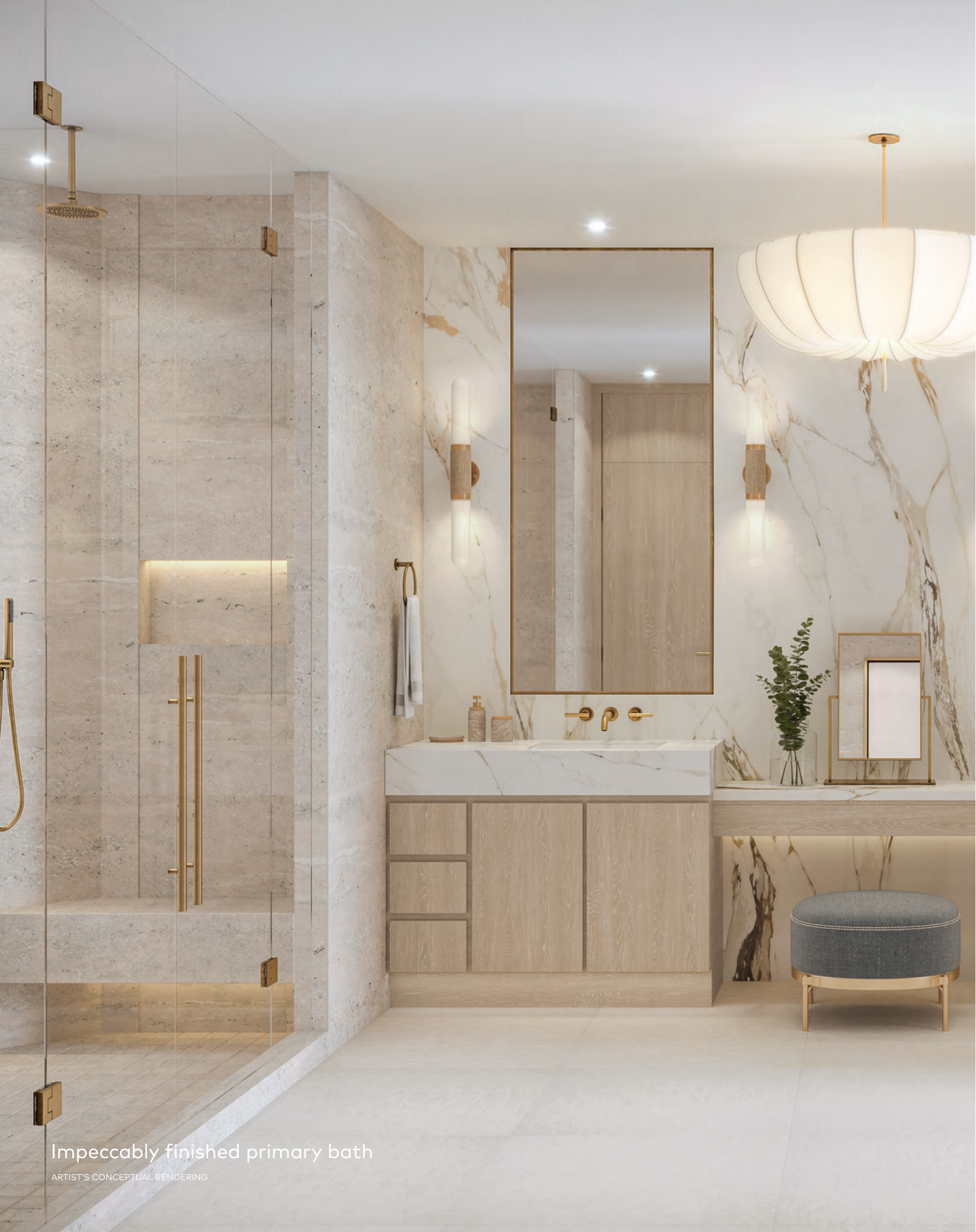
Impeccably finished primary bath