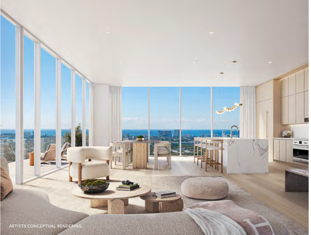
ARTISTS CONCEPTUAL RENDERING

With a community plaza for everyday conveniences and 100,000 SF of limitless amenity space exclusive to residents, Ombelle offers a lifestyle unlike anything yet to be imagined in Fort Lauderdale.