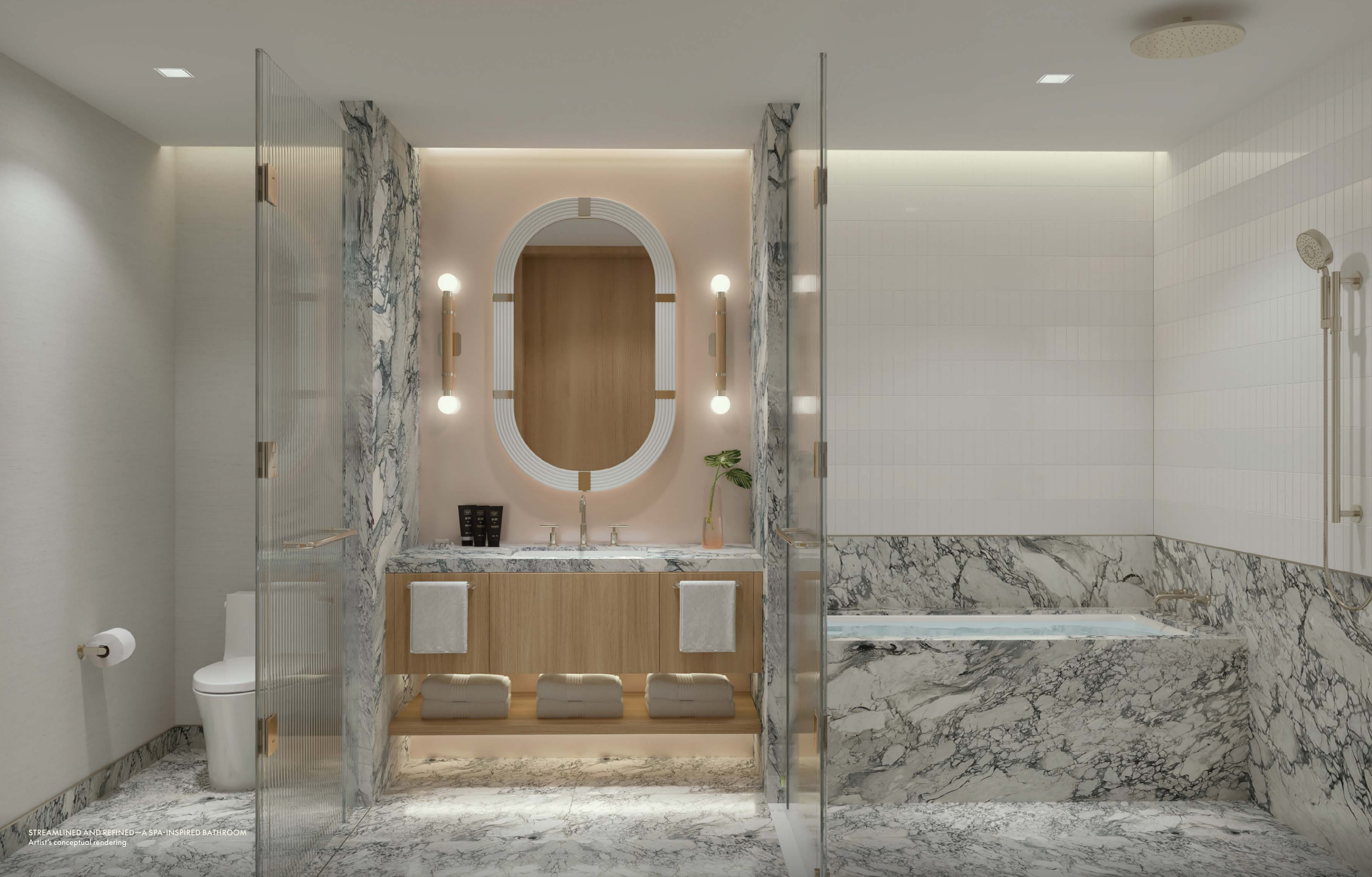
STREAMLINED AND REFINED—A SPA-INSPIRED BATHROOM Artist's conceptual rendering