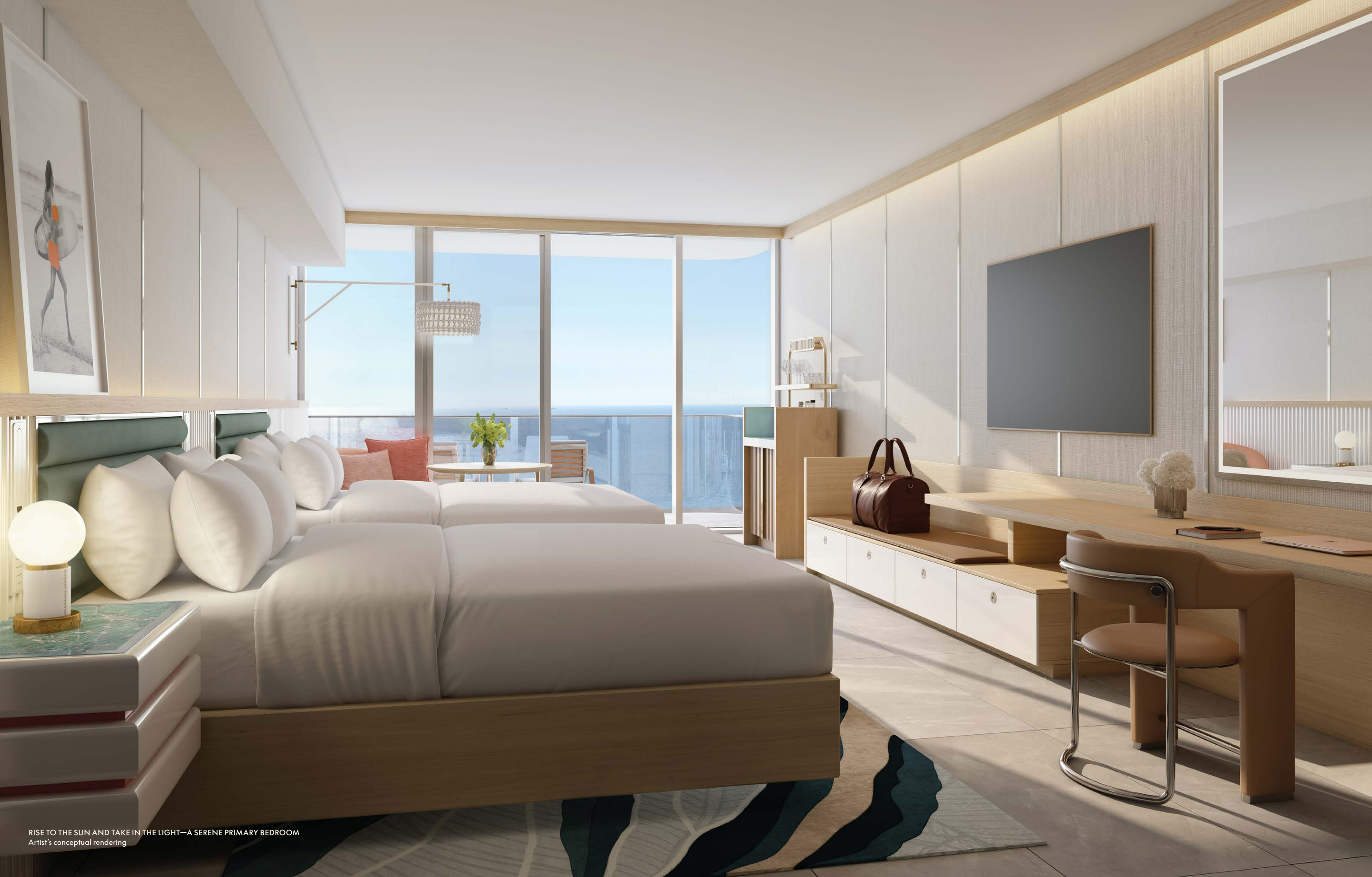
RISE TO THE SUN AND TAKE IN THE LIGHT—A SERENE PRIMARY BEDROOM Artist's conceptual rendering