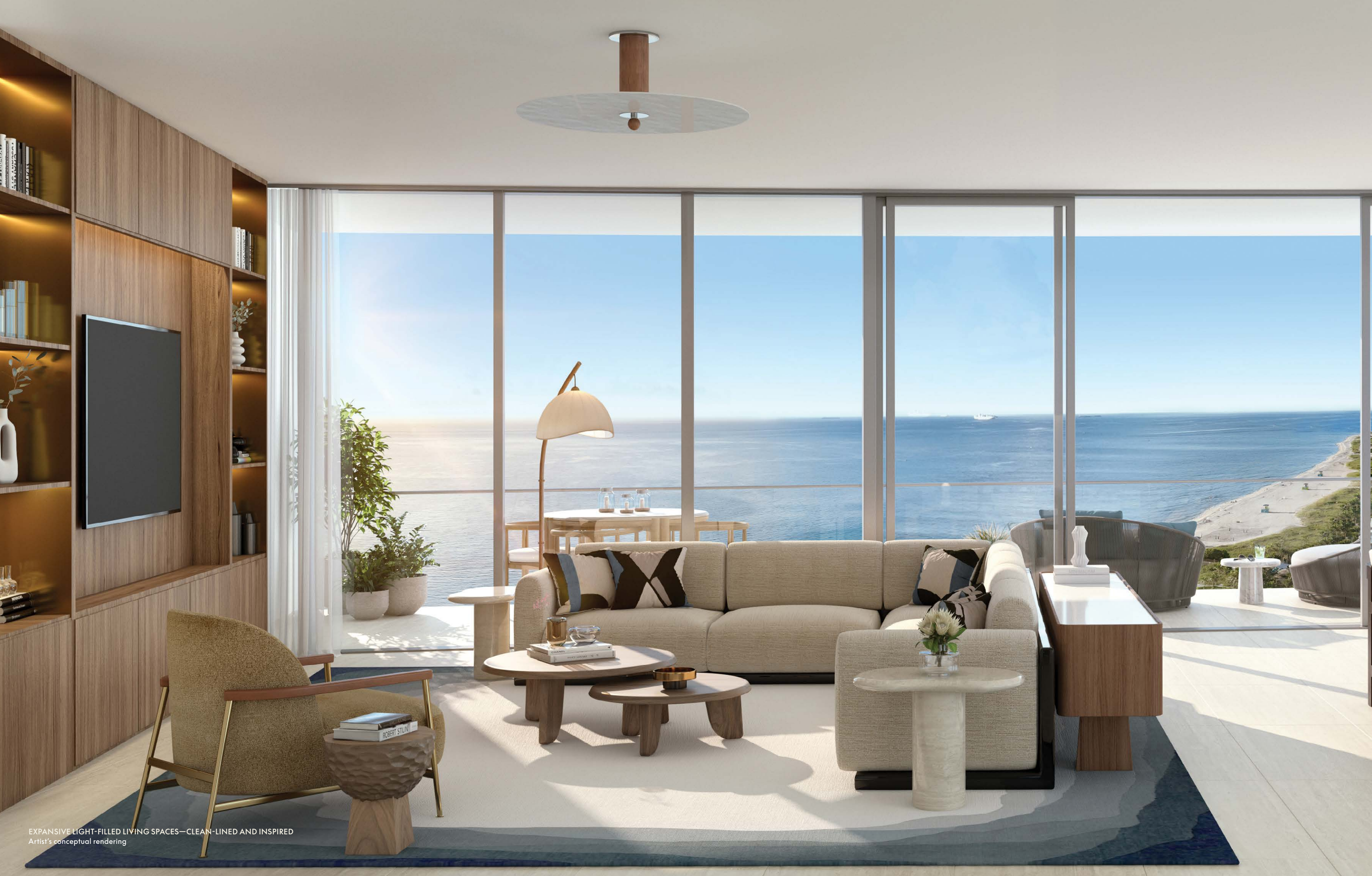
EXPANSIVE LIGHT-FILLED LIVING SPACES—CLEAN-LINED AND INSPIRED Artist's conceptual rendering