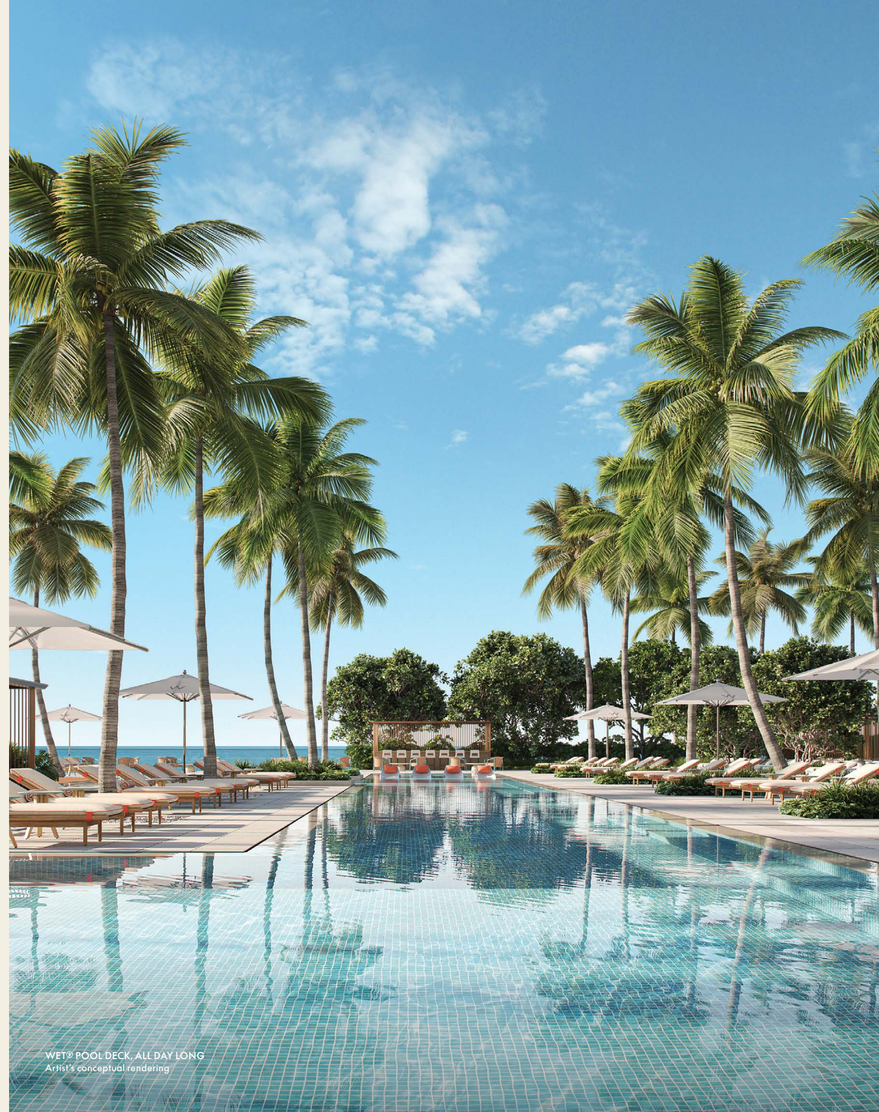
WET® POOL DECK, ALL DAY LONG Artist's conceptual rendering