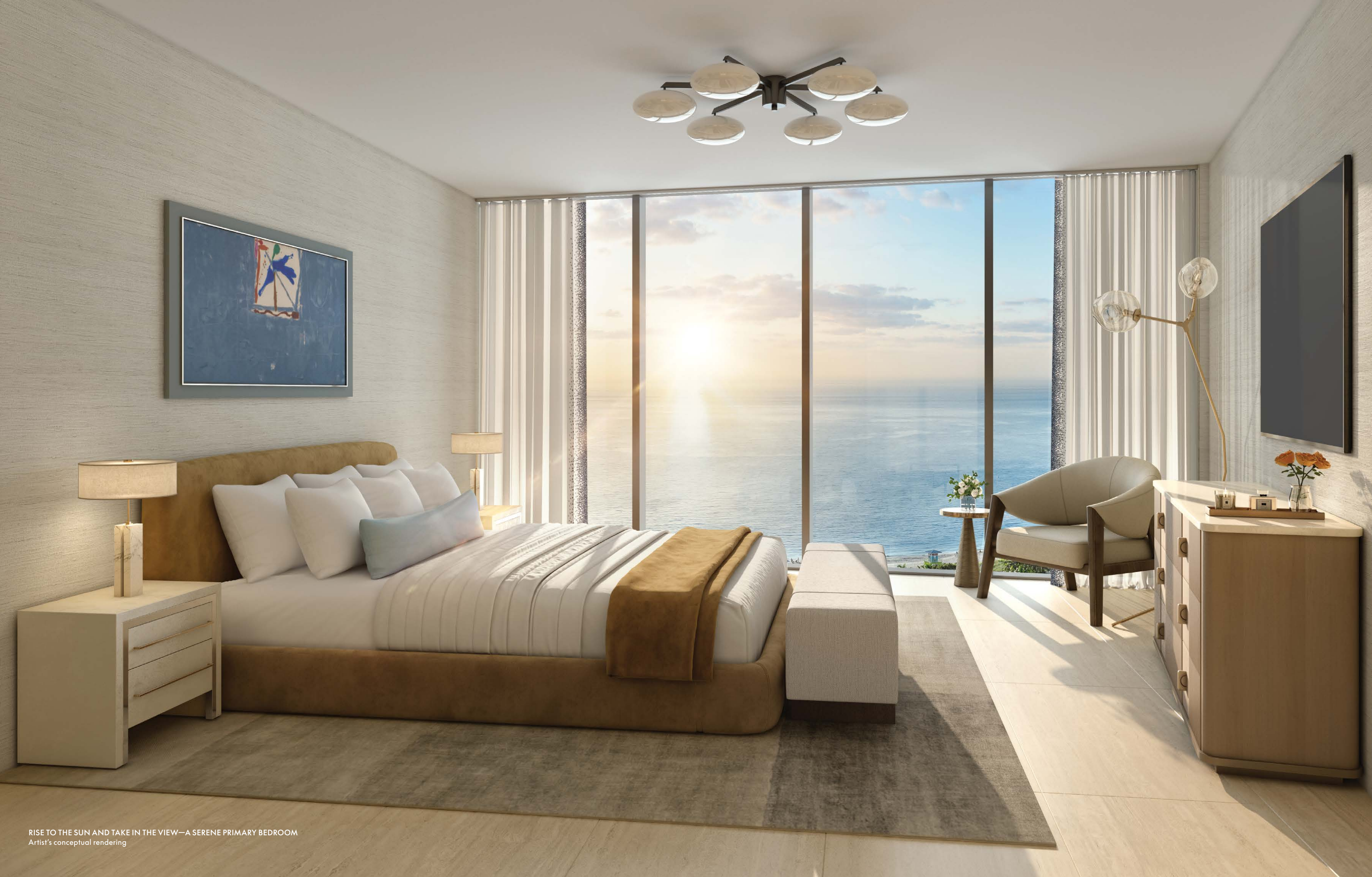
RISE TO THE SUN AND TAKE IN THE VIEW—A SERENE PRIMARY BEDROOM Artist's conceptual rendering