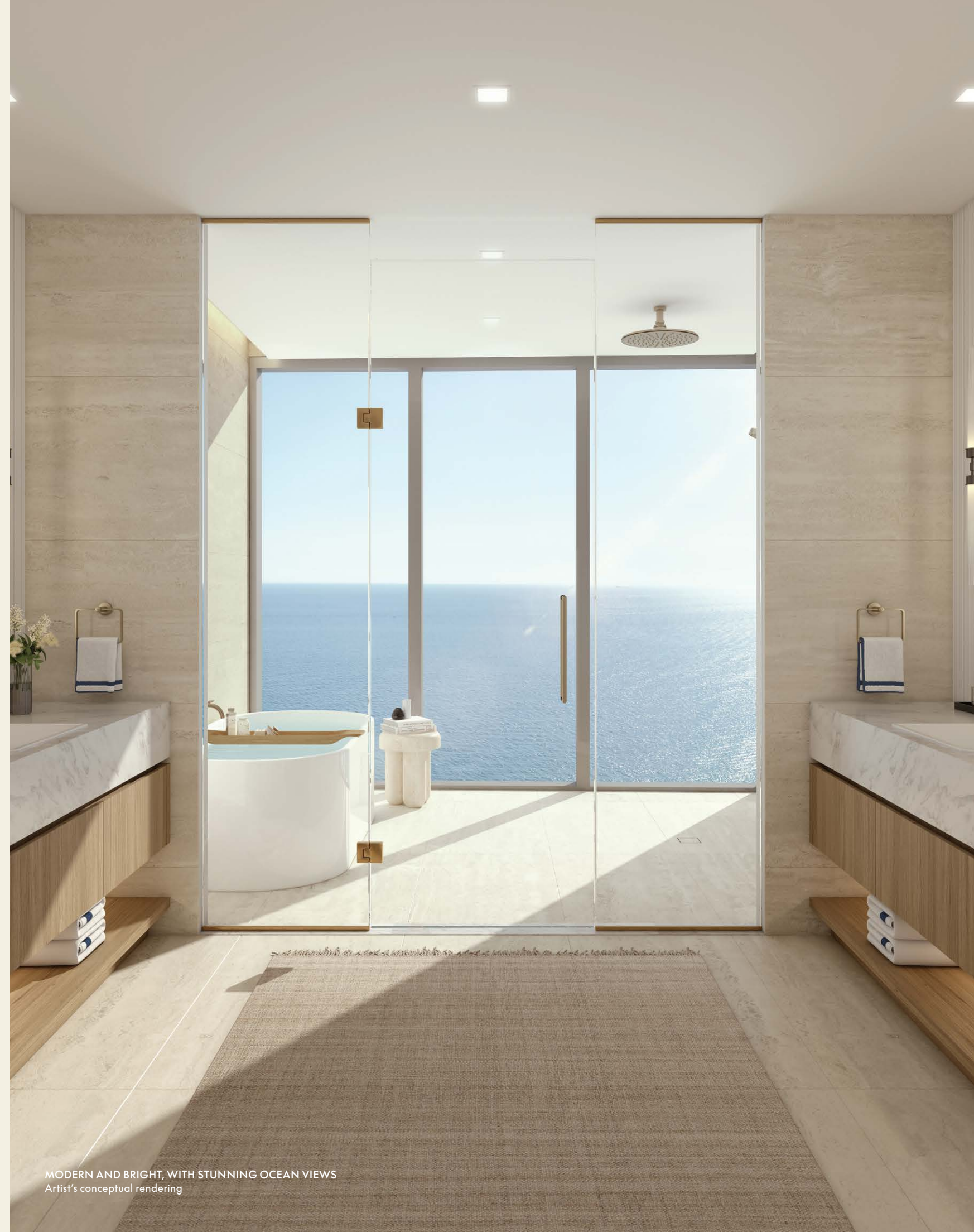
MODERN AND BRIGHT, WITH STUNNING OCEAN VIEWS Artist's conceptual rendering