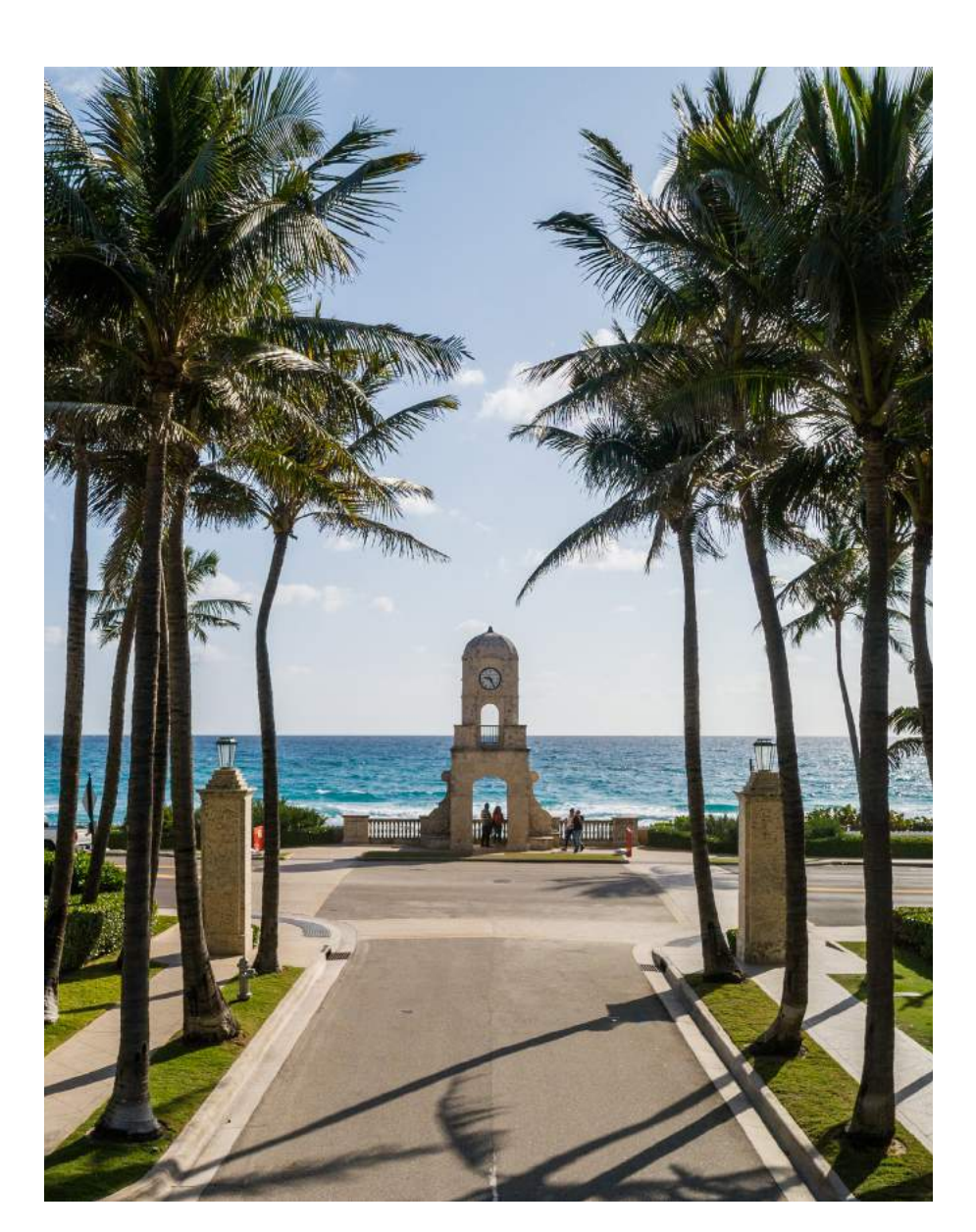
The Ritz-Carlton life: an oasis of luxury, a revered destination, and a world of possibility at your service.

Set in the heart of West Palm Beach, overlooking the Intracoastal and Palm Beach Island, a refined destination of MICHELIN-starred cuisine, dynamic performing arts, exclusive galleries, and iconic boutiques await.