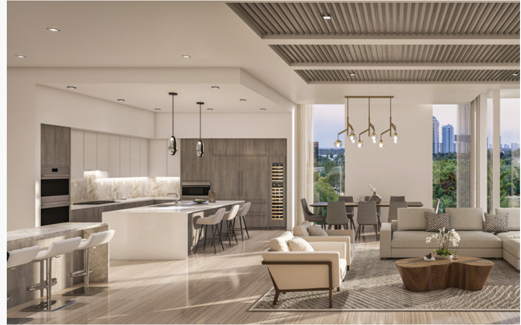
Above: Generously-proportioned kitchens and great rooms feature wet bars with quartz countertops. Below: Private entry foyer, open-concept kitchen with adjoining wet bar and grand master suite.

Private elevators with controlled access ensure the utmost in discretion. A full suite of professional-grade Wolf® and Sub-Zero® kitchen appliances bear witness to memorable social gatherings. Floor-to-ceiling, triple-panel, impact-resistant glass doors and windows preserve an environment of quiet, sumptuous comfort. Outfitted with double walk-in closets, free-standing soaking tubs, glass-enclosed showers and European double-vanities, grand owner's suites are private sanctuaries of refinement and relaxation. Set to raise expectations for well-appointed, waterfront living, here, ocean-inspired elegance reigns supreme.