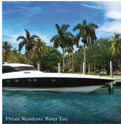
Private Residents' Water Taxi