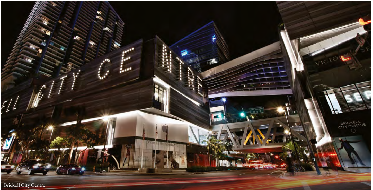
Brickell City Centre

Perfectly positioned at the entrance of Brickell Avenue, where the Miami River meets the beautiful blue waters of Biscayne Bay, and the bustling financial district blends with high-end shopping, top restaurants, cultural hot spots and exiting nightlife – this iconic neighborhood is an all-day all-night lifestyle destination, aptly named the Manhattan of the South.