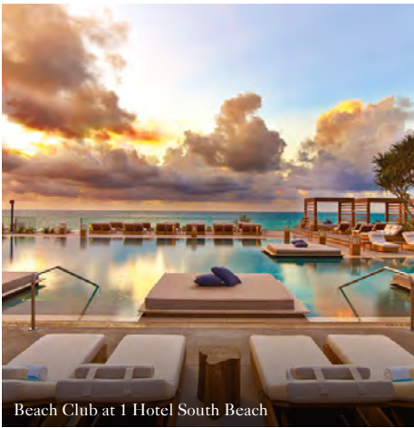
Beach Club at 1 Hotel South Beach

The private marina, planned riverside restaurant and lushly landscaped river promenade invite residents to spend hours and days luxuriating in the infinite energy and organic sparkle of life by the water. Watch the superyachts come and go, take a sunset stroll towards the bay, or head to a number of chic waterside restaurants courtesy of our private water taxi service. Residents can enjoy private membership and exclusive access to the Beach Club at 1 Hotel South Beach, SH Hotels & Resorts sister property. With loungers, beach towel services, cabanas, and seaside snack and beverage services, this waterfront community will cater to leisurely hours under the sun. Take a break from the hustle and bustle of the city and unwind with a cool drink in hand and the sand between your toes.