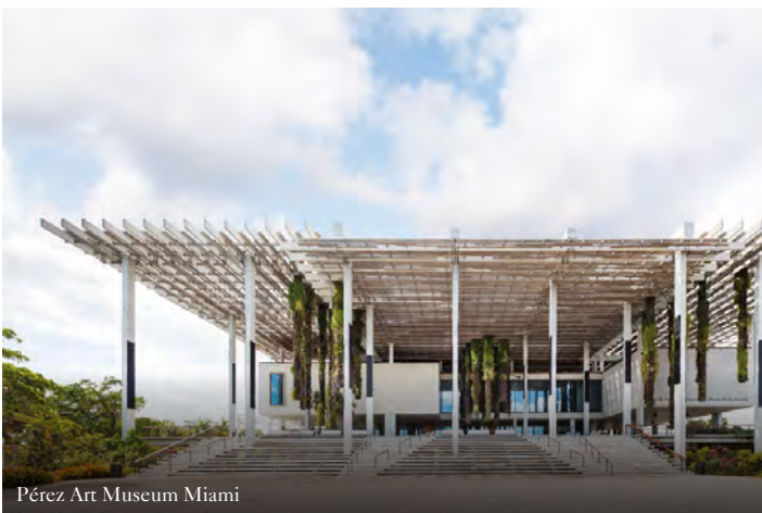
Pérez Art Museum Miami