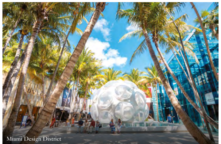
Miami Design District