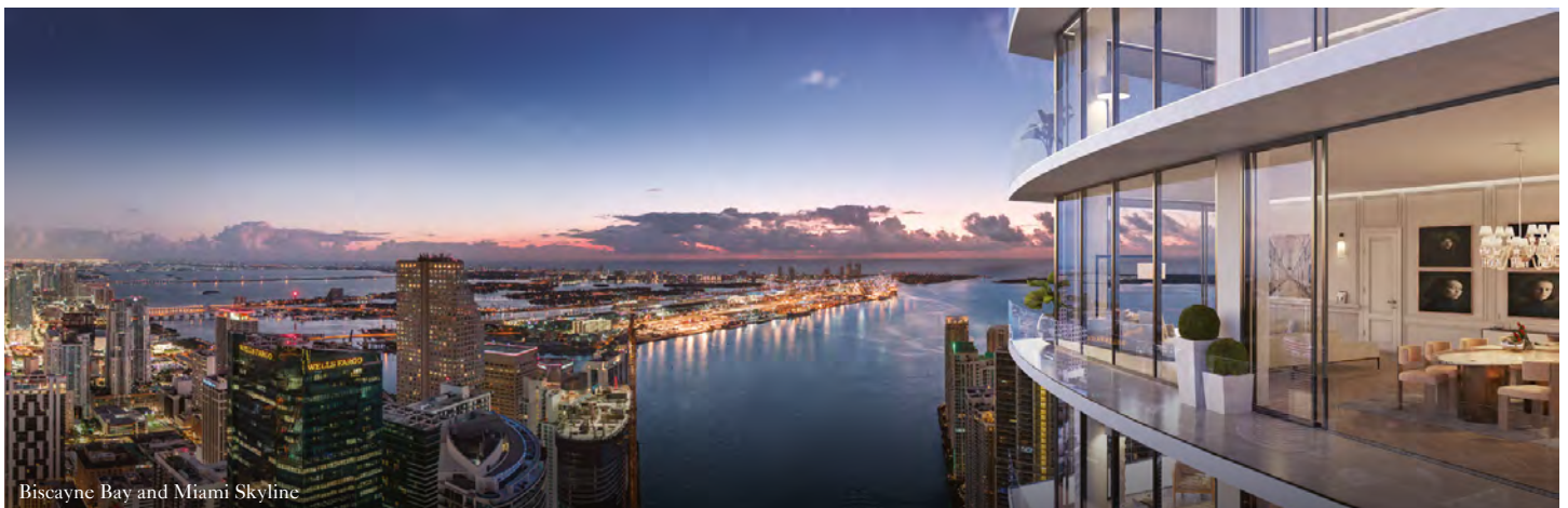
Biscayne Bay and Miami Skyline