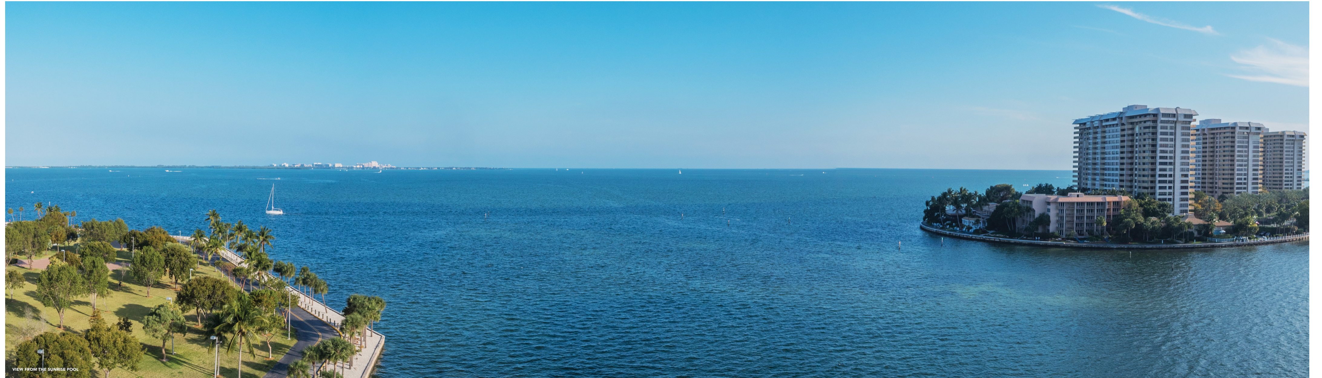
VIEW FROM THE SUNRISE POOL