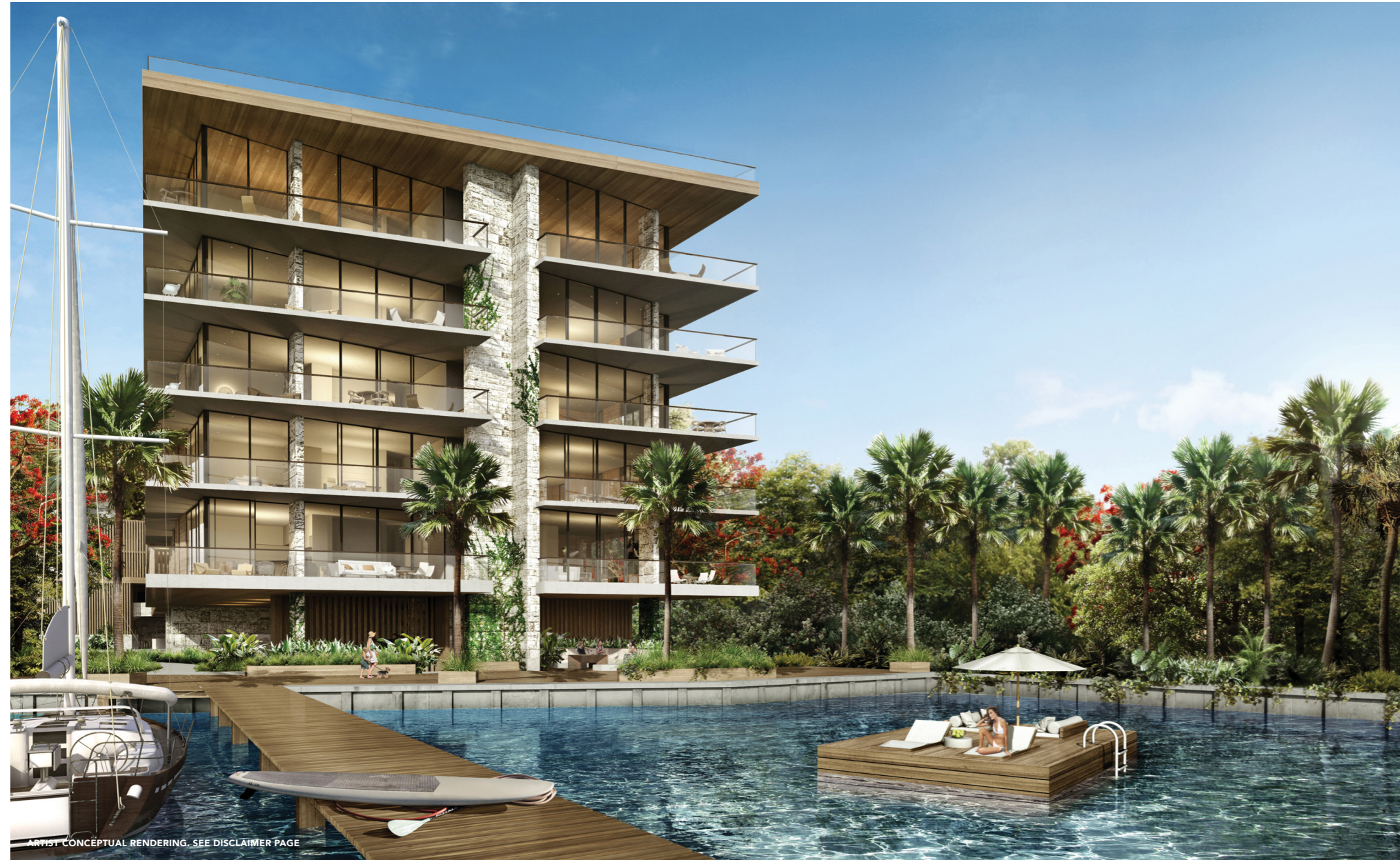
ARTIST CONCEPTUAL RENDERING. SEE DISCLAIMER PAGE