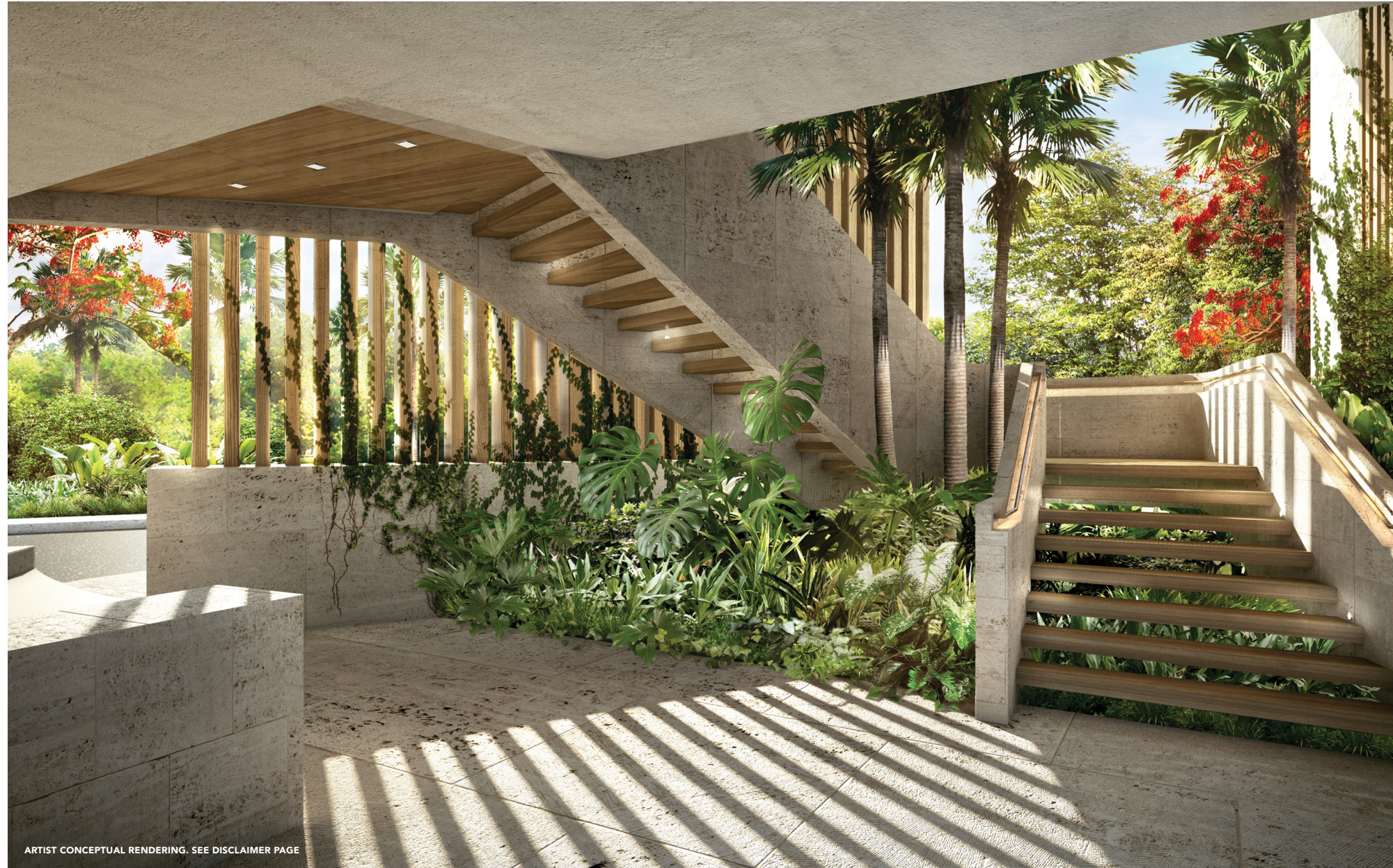
ARTIST CONCEPTUAL RENDERING. SEE DISCLAIMER PAGE