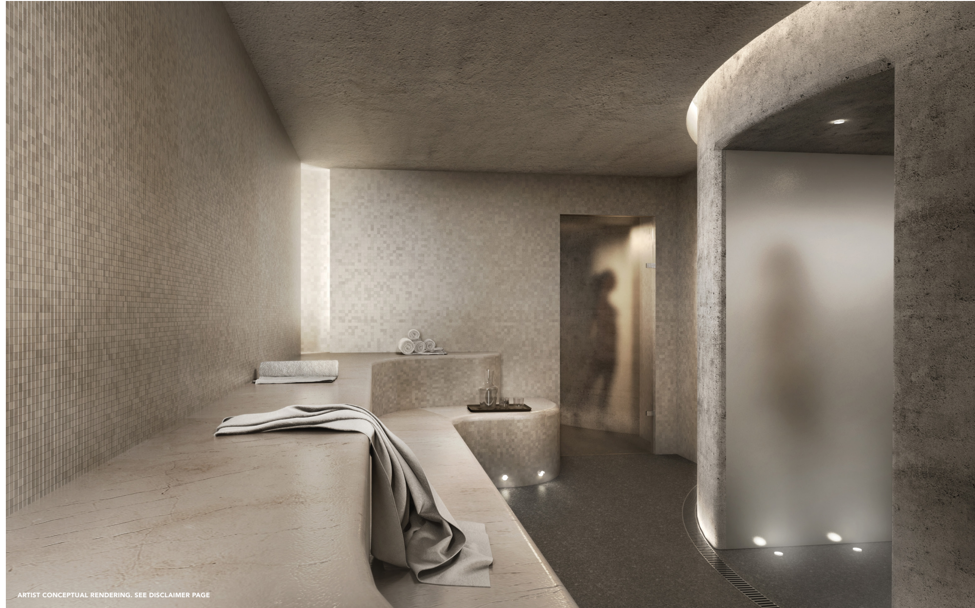
ARTIST CONCEPTUAL RENDERING. SEE DISCLAIMER PAGE