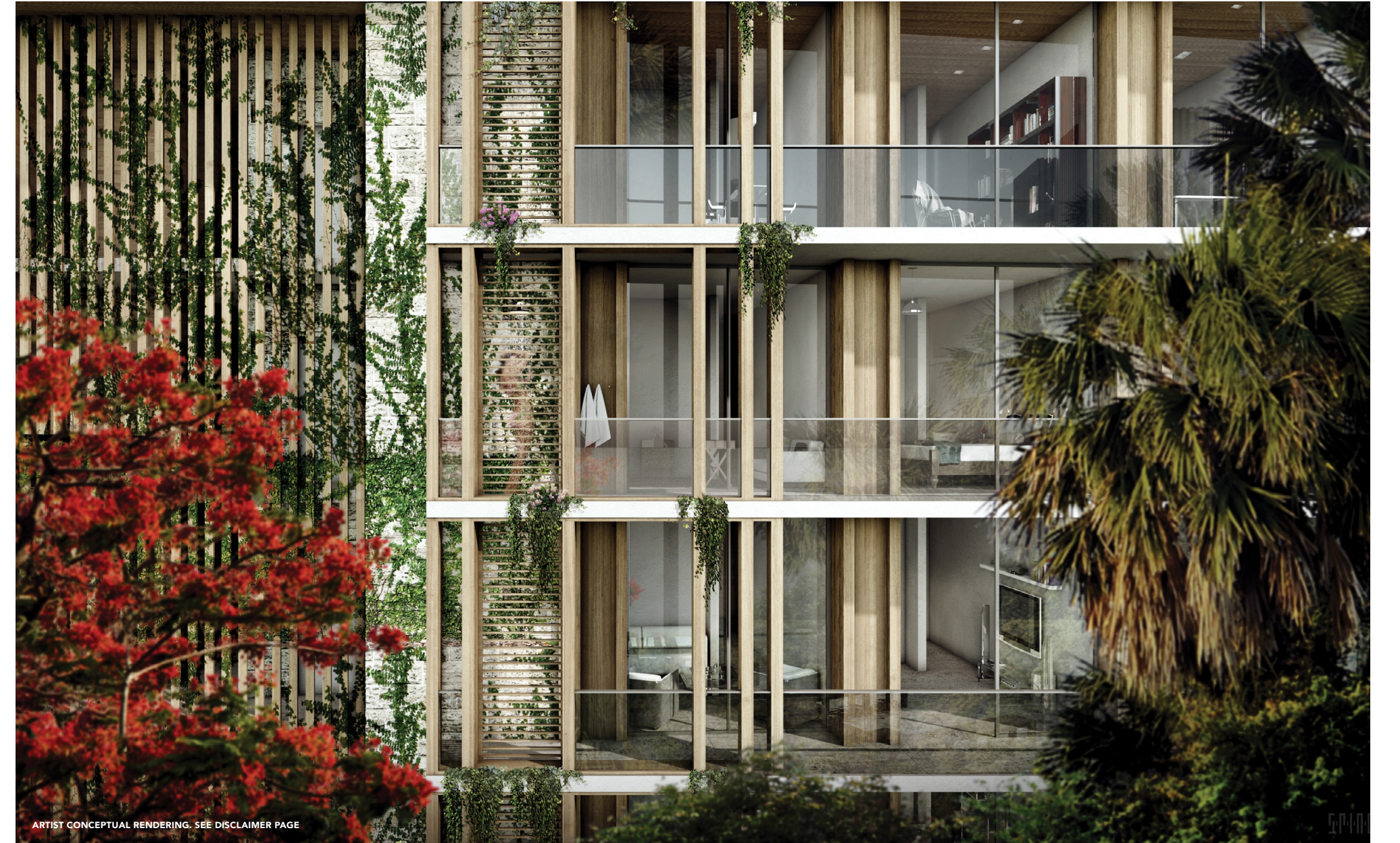
ARTIST CONCEPTUAL RENDERING. SEE DISCLAIMER PAGE