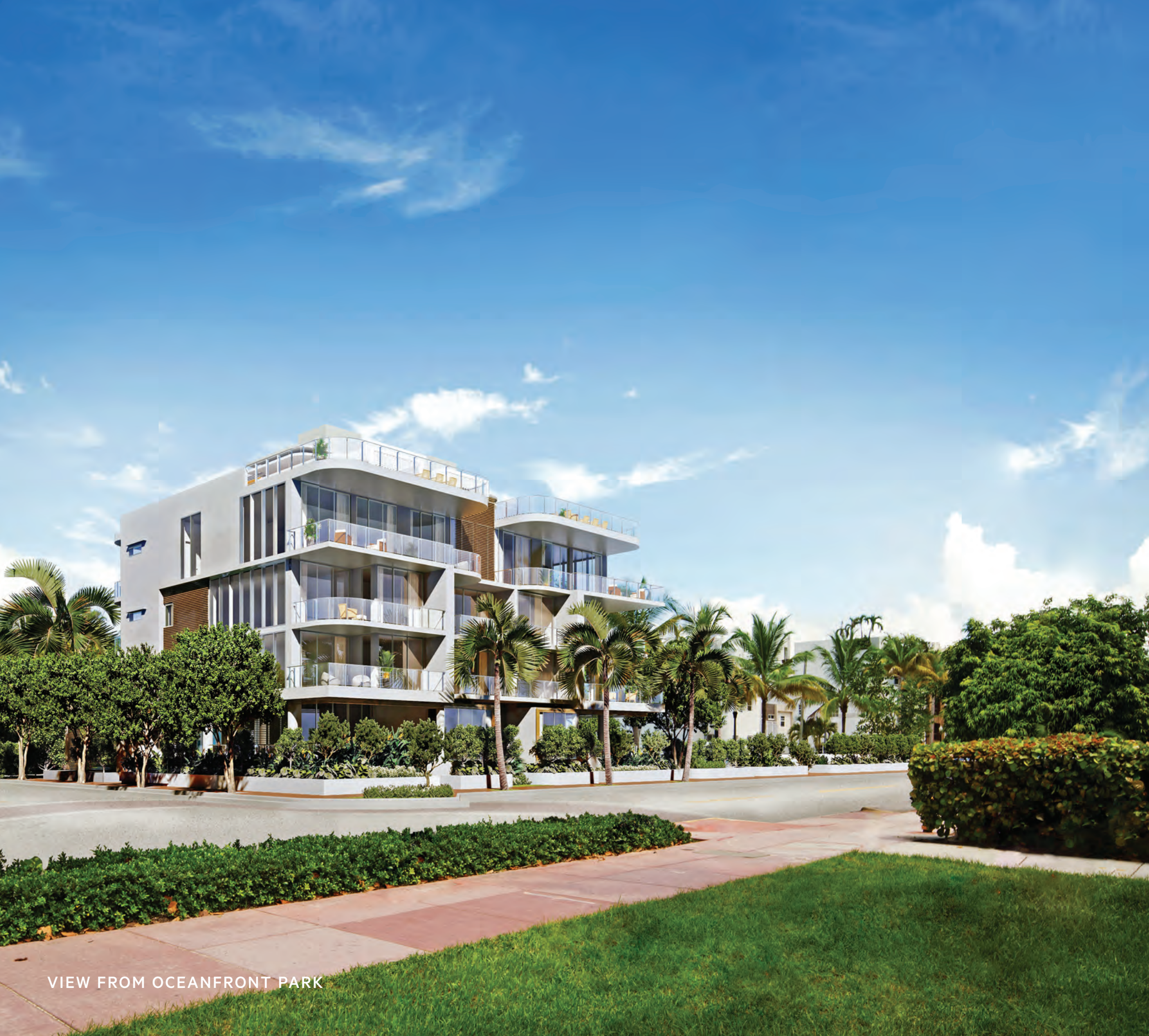
VIEW FROM OCEANFRONT PARK