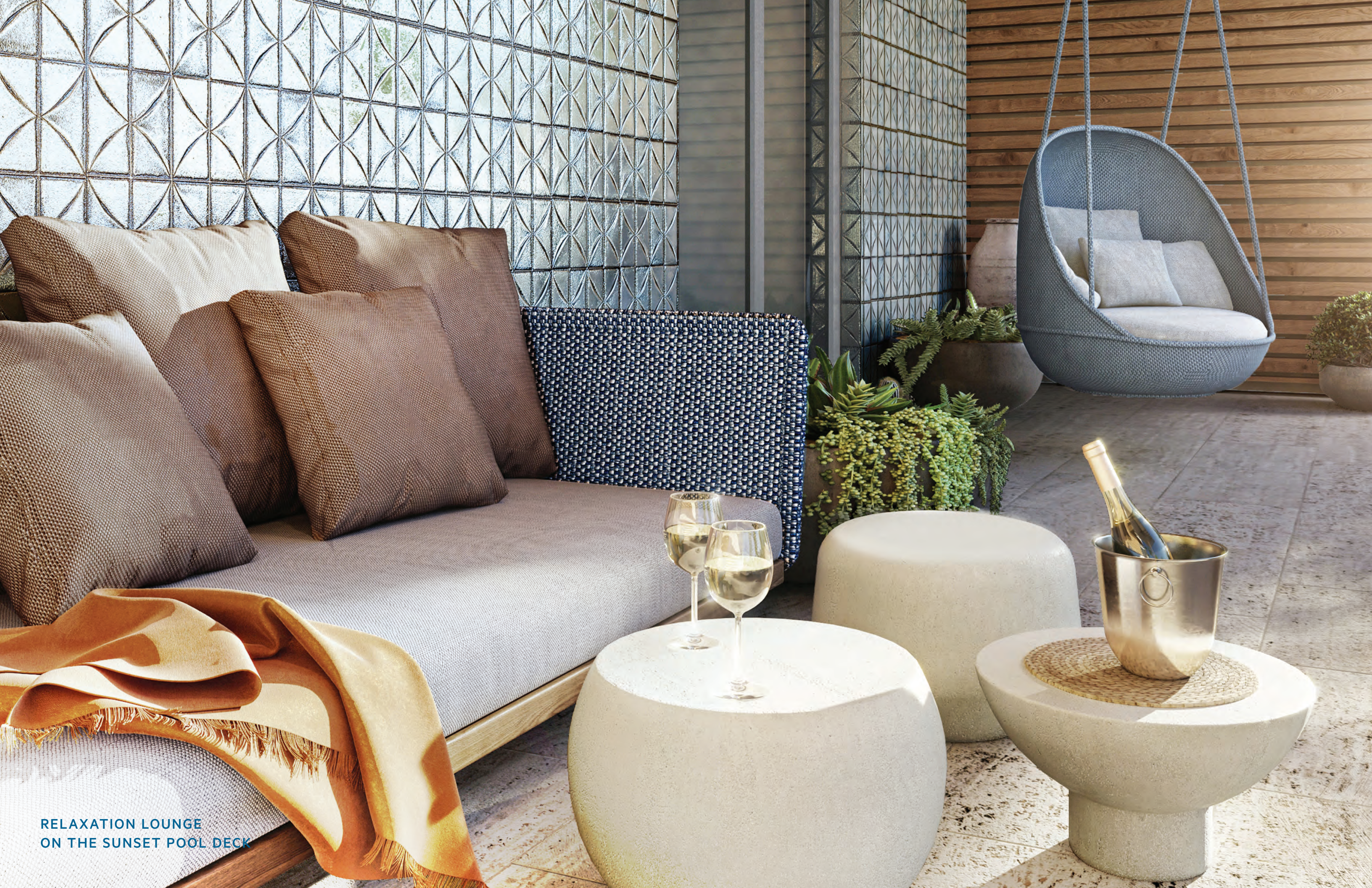
RELAXATION LOUNGE ON THE SUNSET POOL DECK