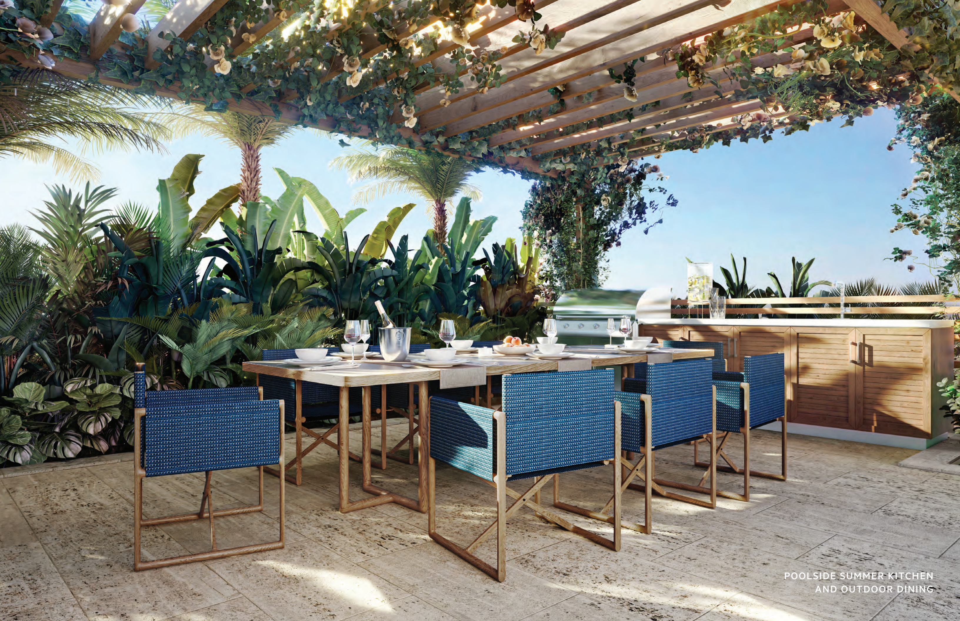
POOLSIDE SUMMER KITCHEN AND OUTDOOR DINING