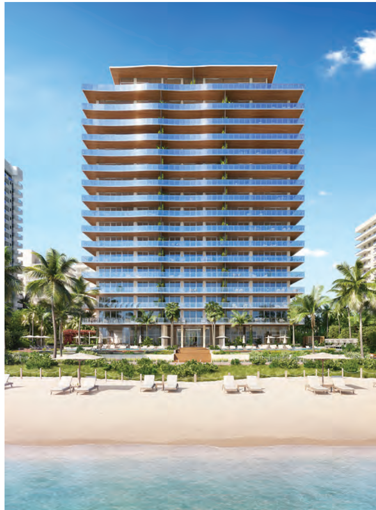
57 Ocean 5775 Collins Avenue, Miami Beach