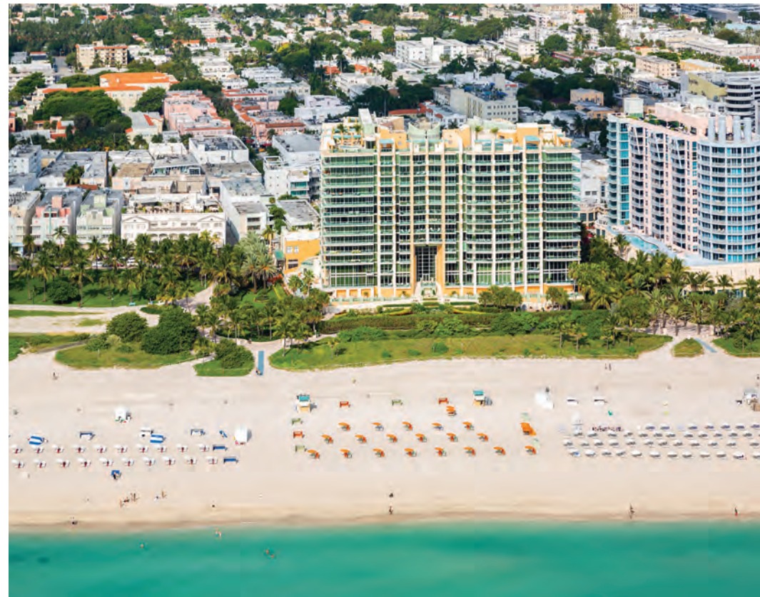
Il Villaggio 1455 Ocean Drive, Miami Beach