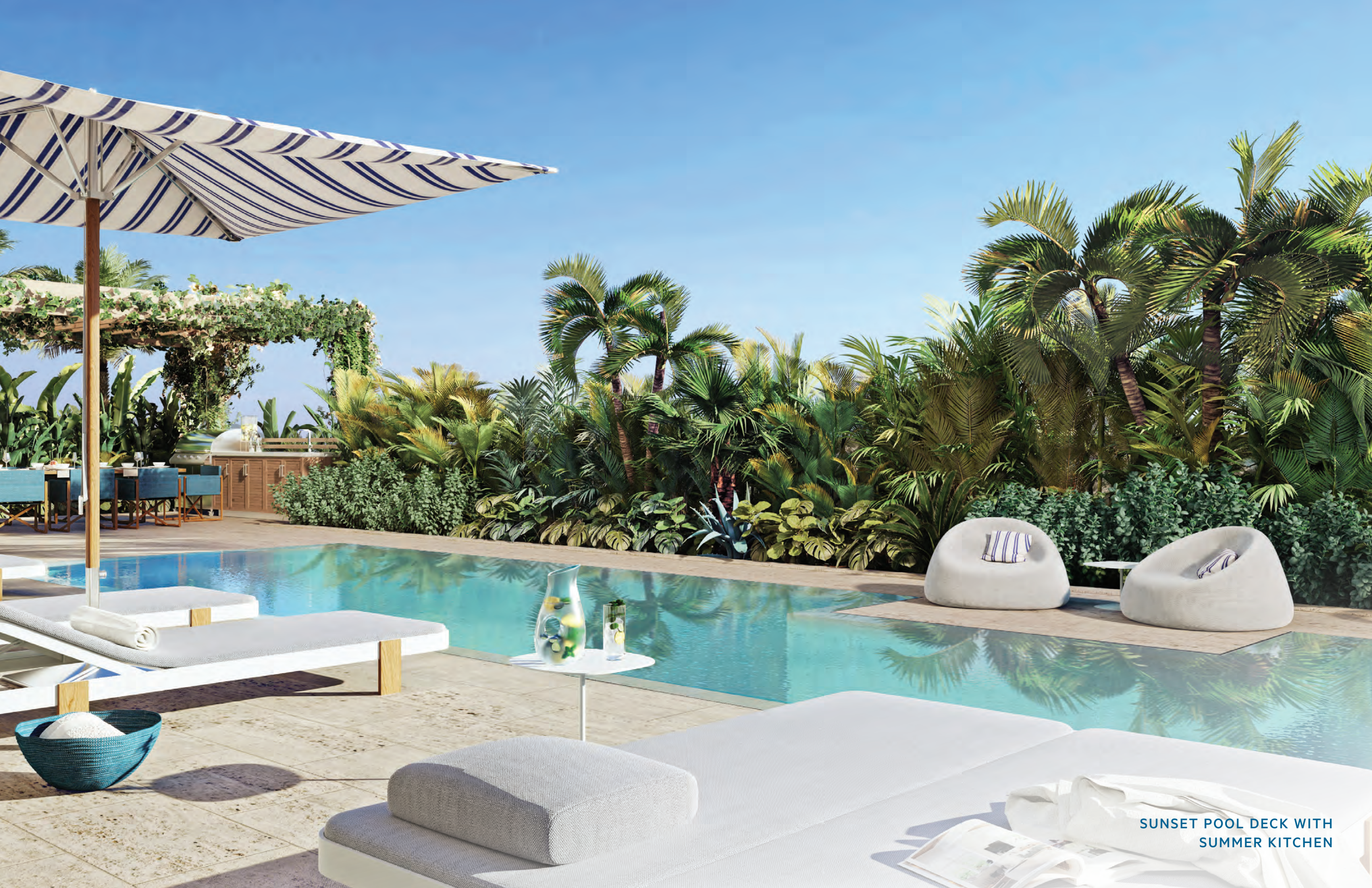
SUNSET POOL DECK WITH SUMMER KITCHEN