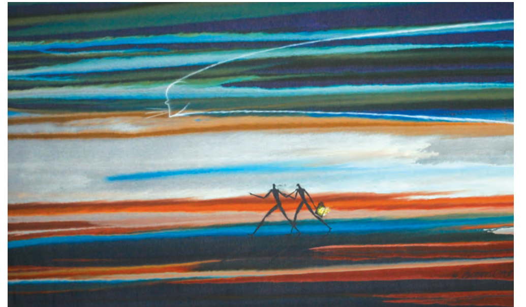
"Caminando Juntos" by Jose Bedia