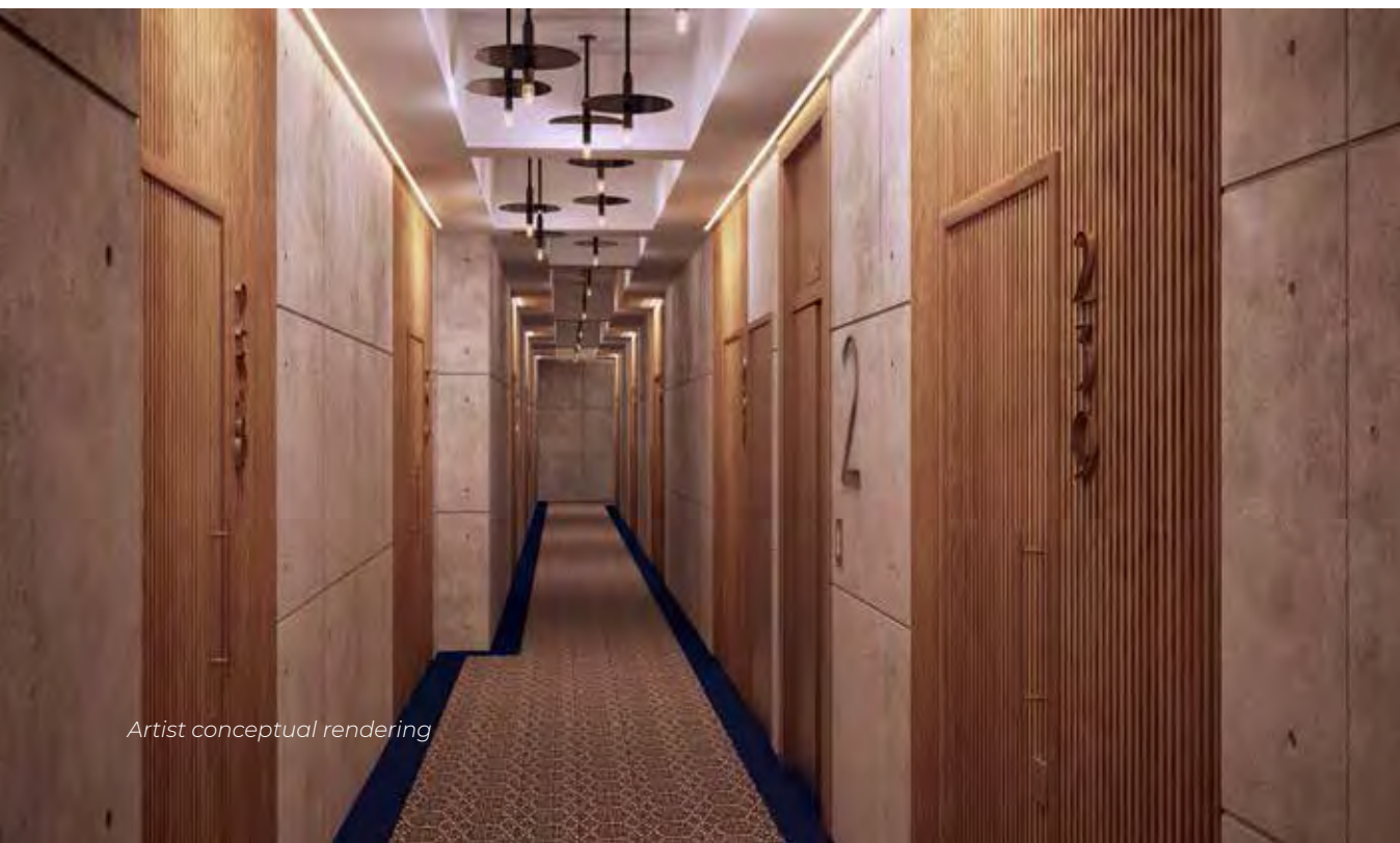
Artist conceptual rendering