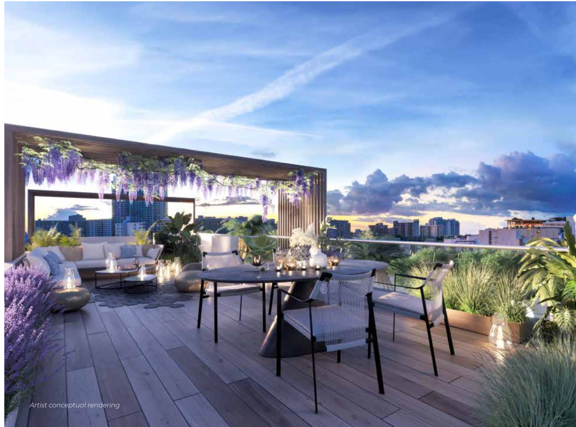
Artist conceptual rendering