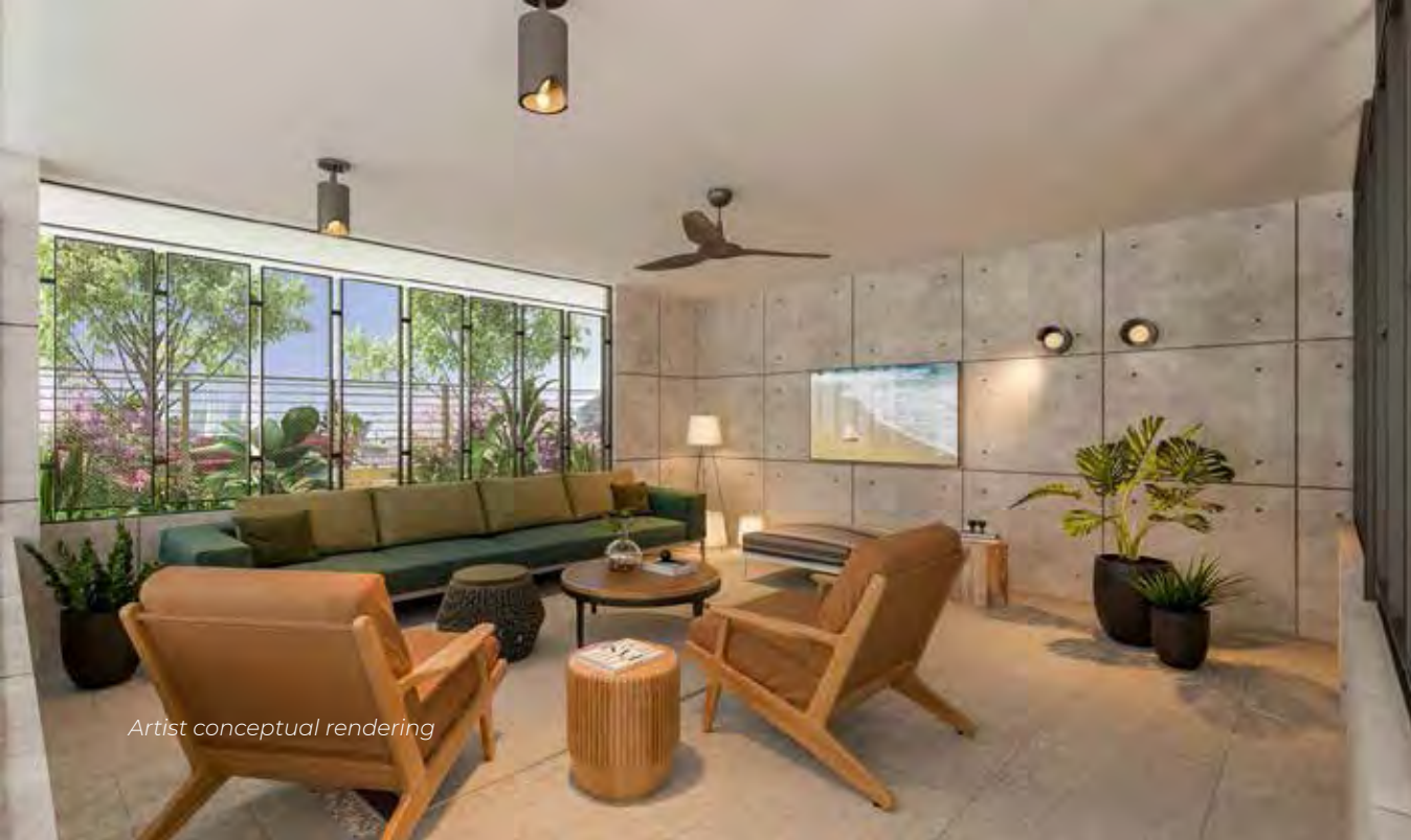
Artist conceptual rendering