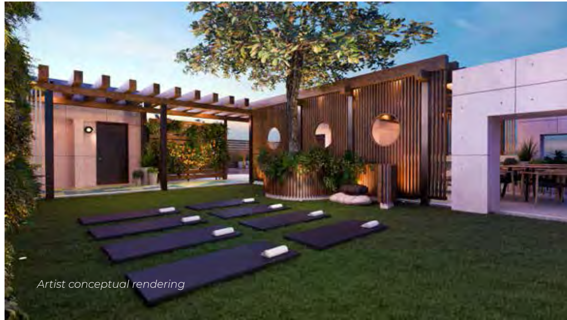
Artist conceptual rendering