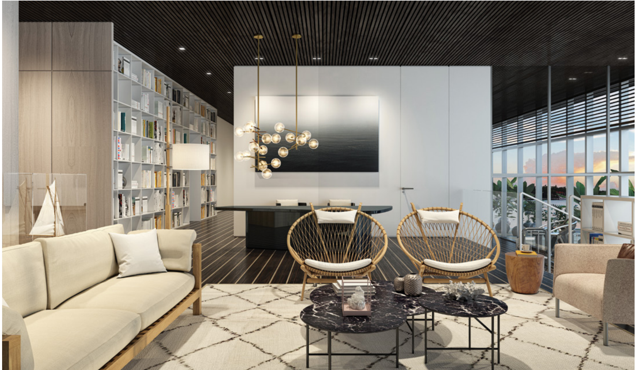
Côte d'Azur-inspired reception and lobby areas, curated by Lissoni®