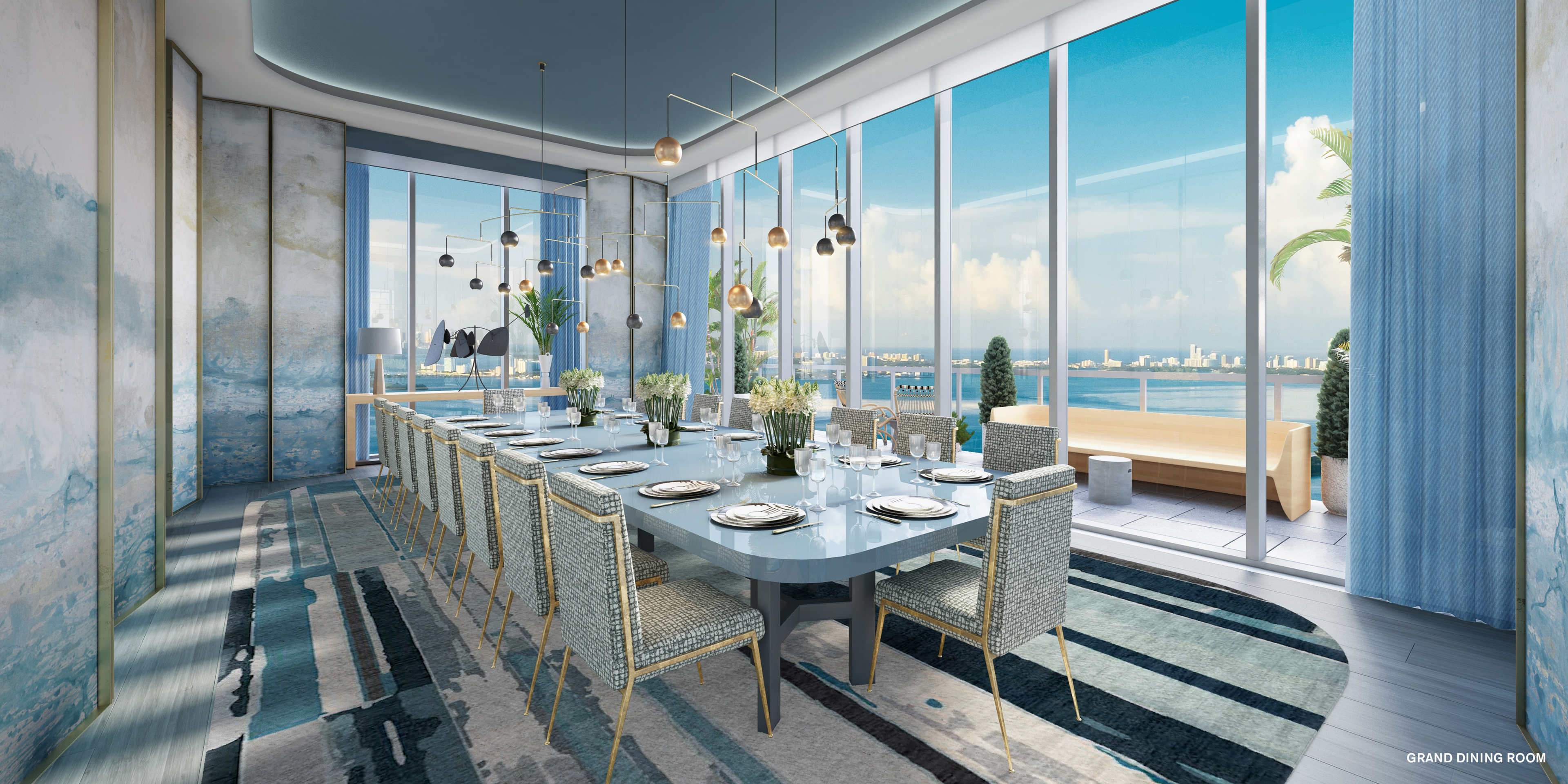
GRAND DINING ROOM