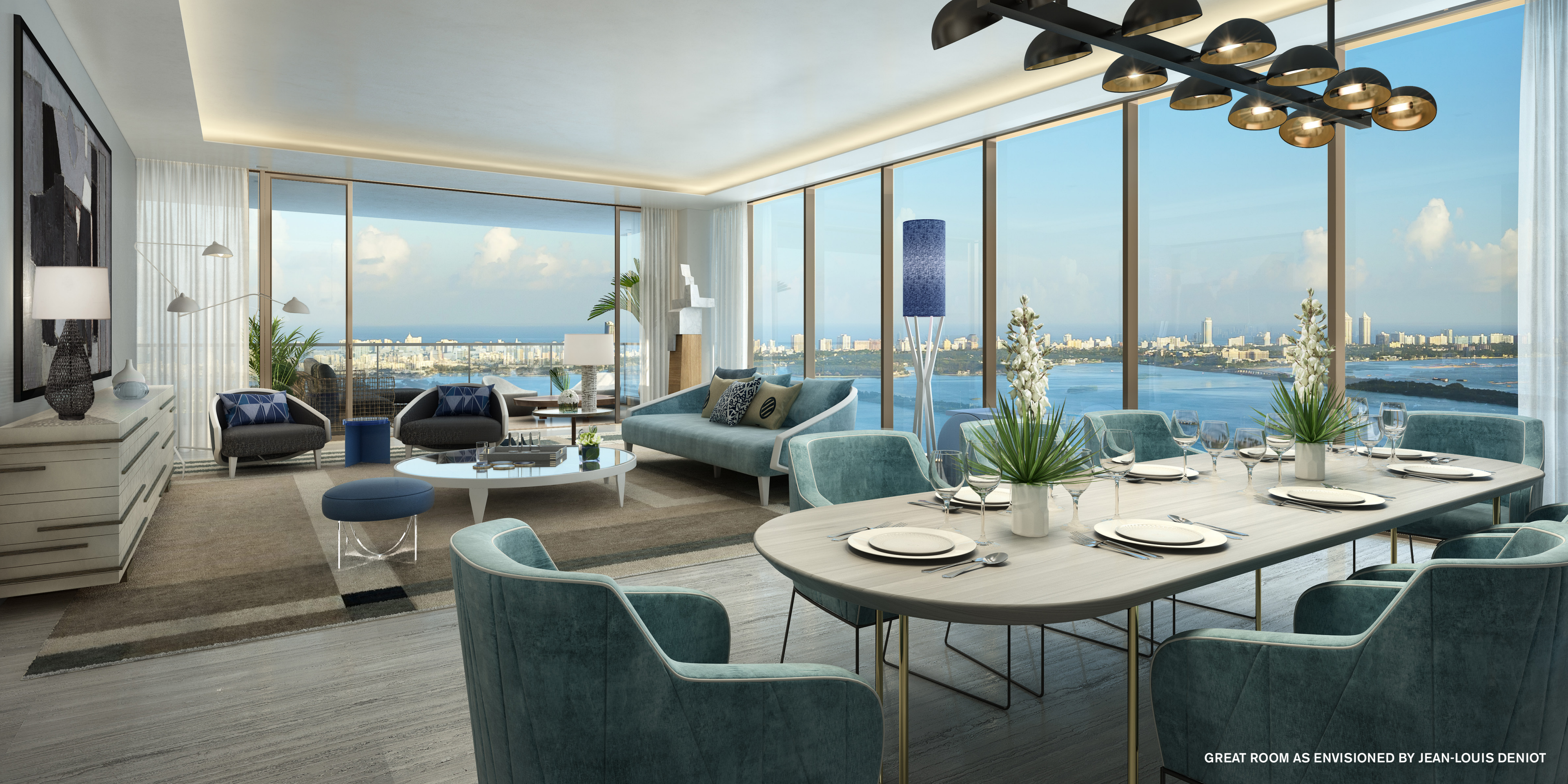
GREAT ROOM AS ENVISIONED BY JEAN-LOUIS DENIOT