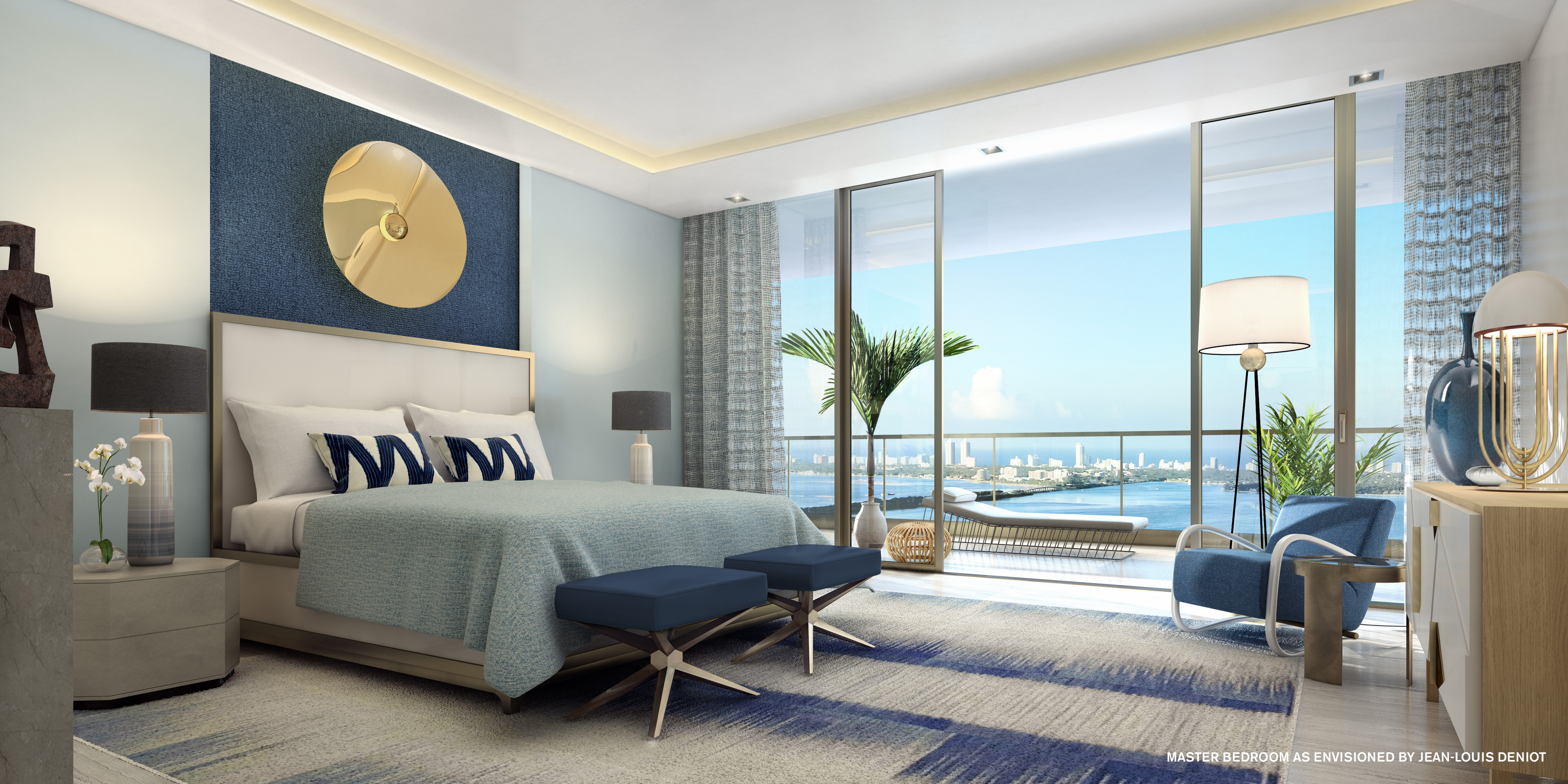
MASTER BEDROOM AS ENVISIONED BY JEAN-LOUIS DENIOT