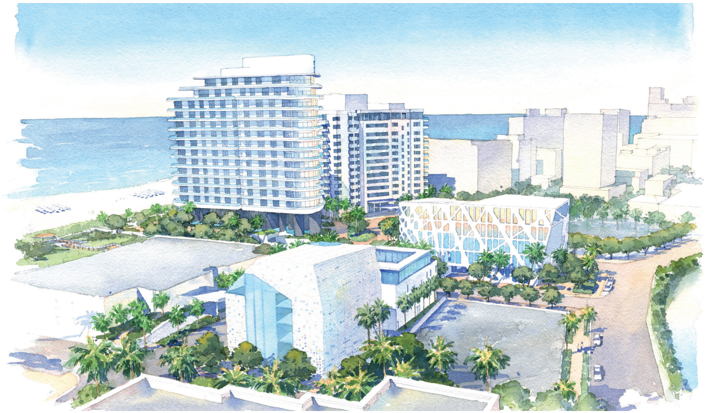
Looking south towards Faena District. Artist Rendering.