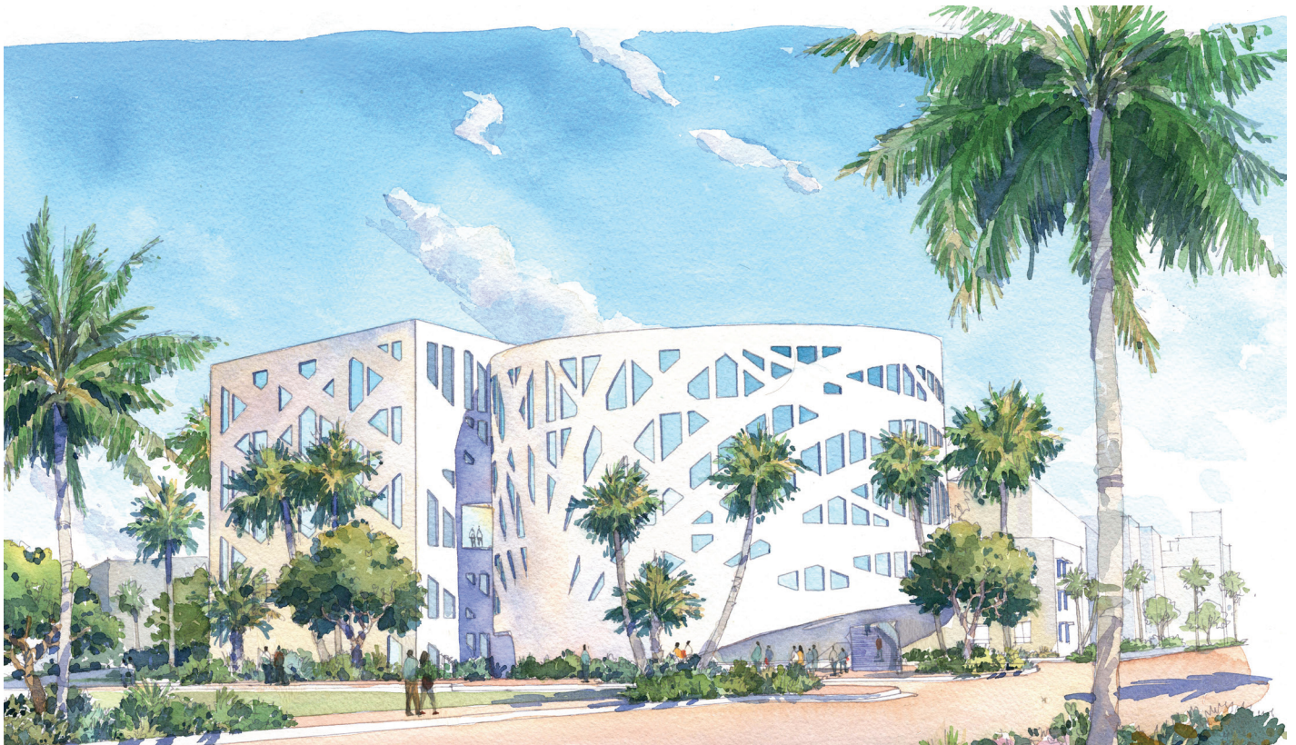
Faena Arts Center. Artist Rendering.