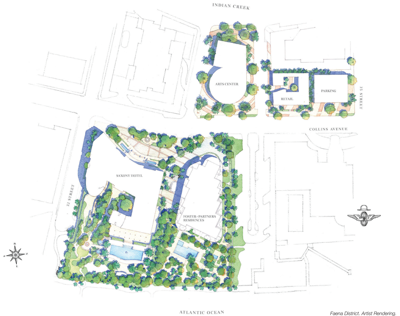
Faena District. Artist Rendering.