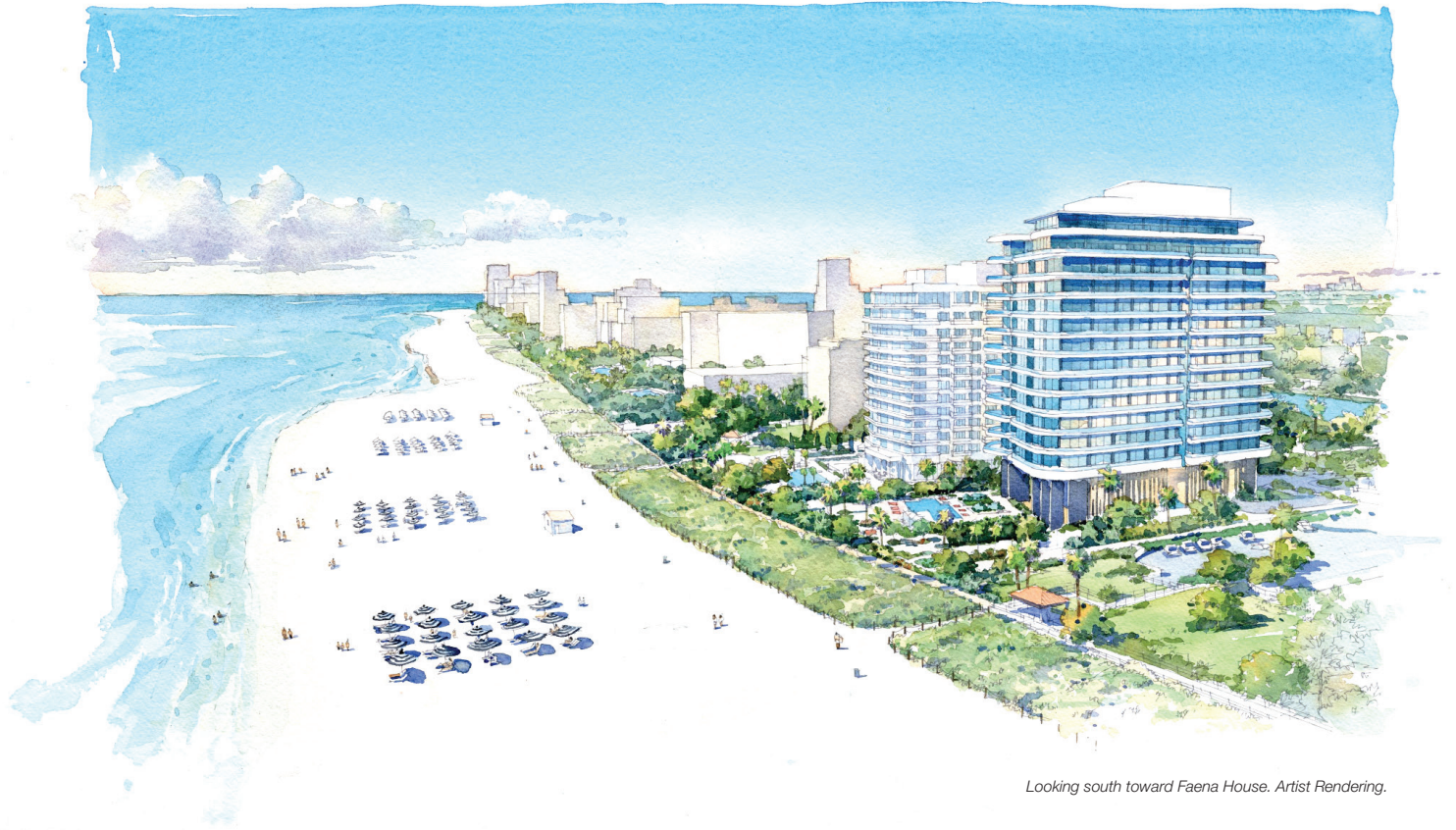
Looking south toward Faena House. Artist Rendering.