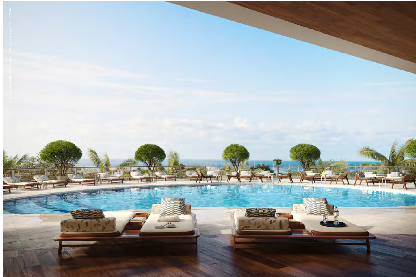
Bayshore Club Pool Deck

Personalized services, including a 24-hour concierge, are complemented by a host of amenities at Mr. C Residences Coconut Grove.