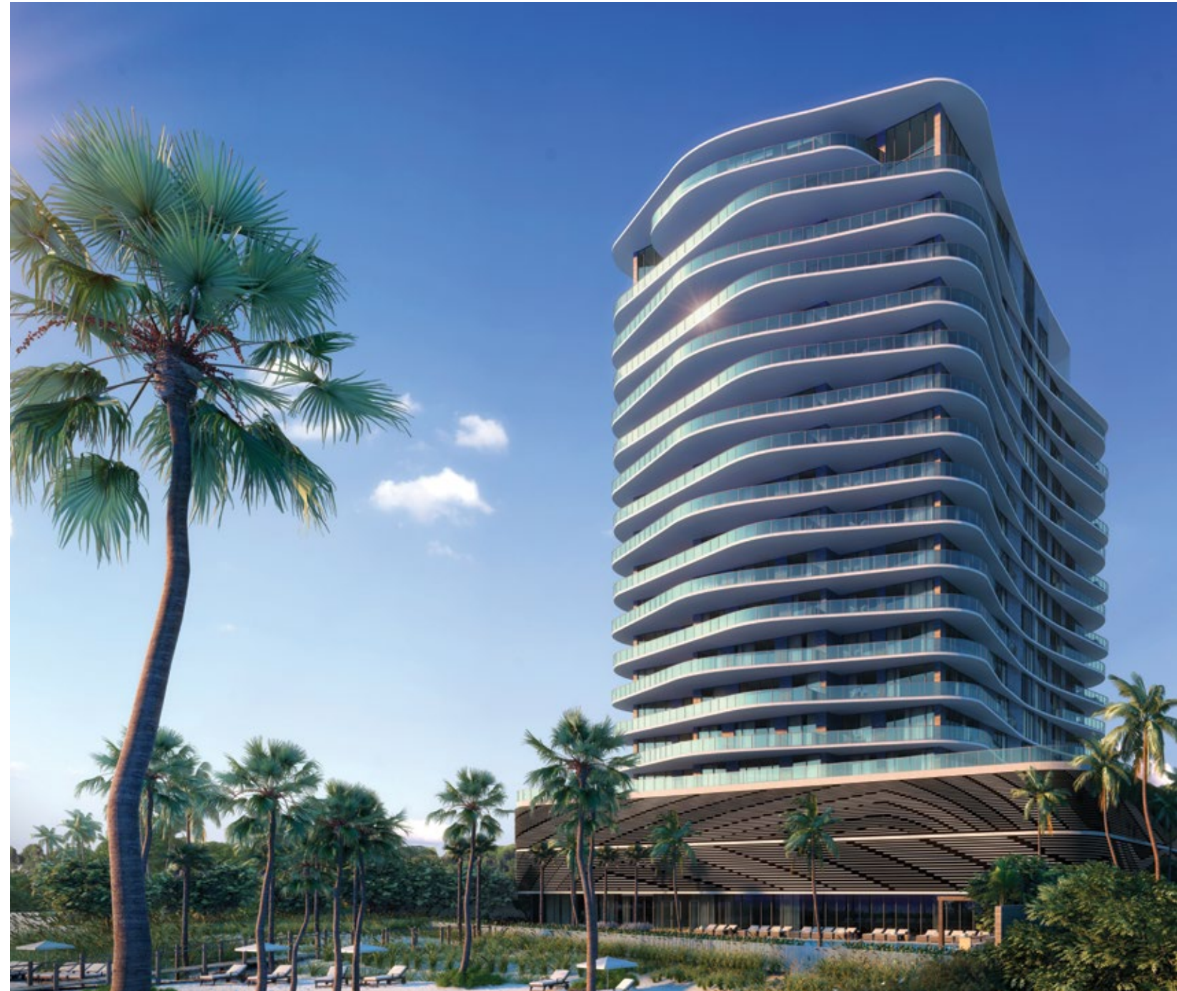
Artist's conceptual rendering.

Sand dunes and a carefully curated blend of beach grass, palm trees and other native plants make the private beach and other outdoor areas appear as if they have been evolving naturally and untouched for years.