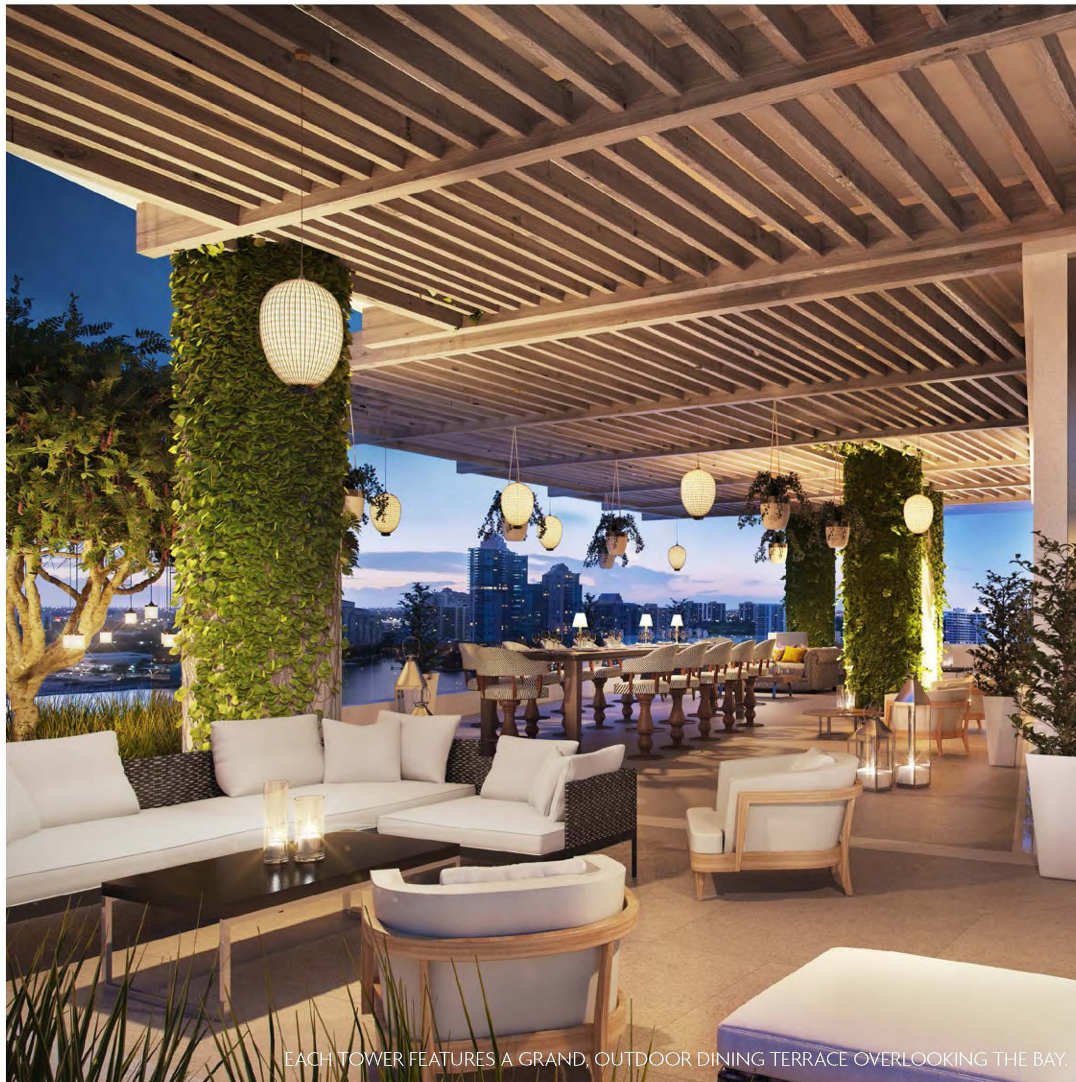
EACH TOWER FEATURES A GRAND, OUTDOOR DINING TERRACE OVERLOOKING THE BAY.