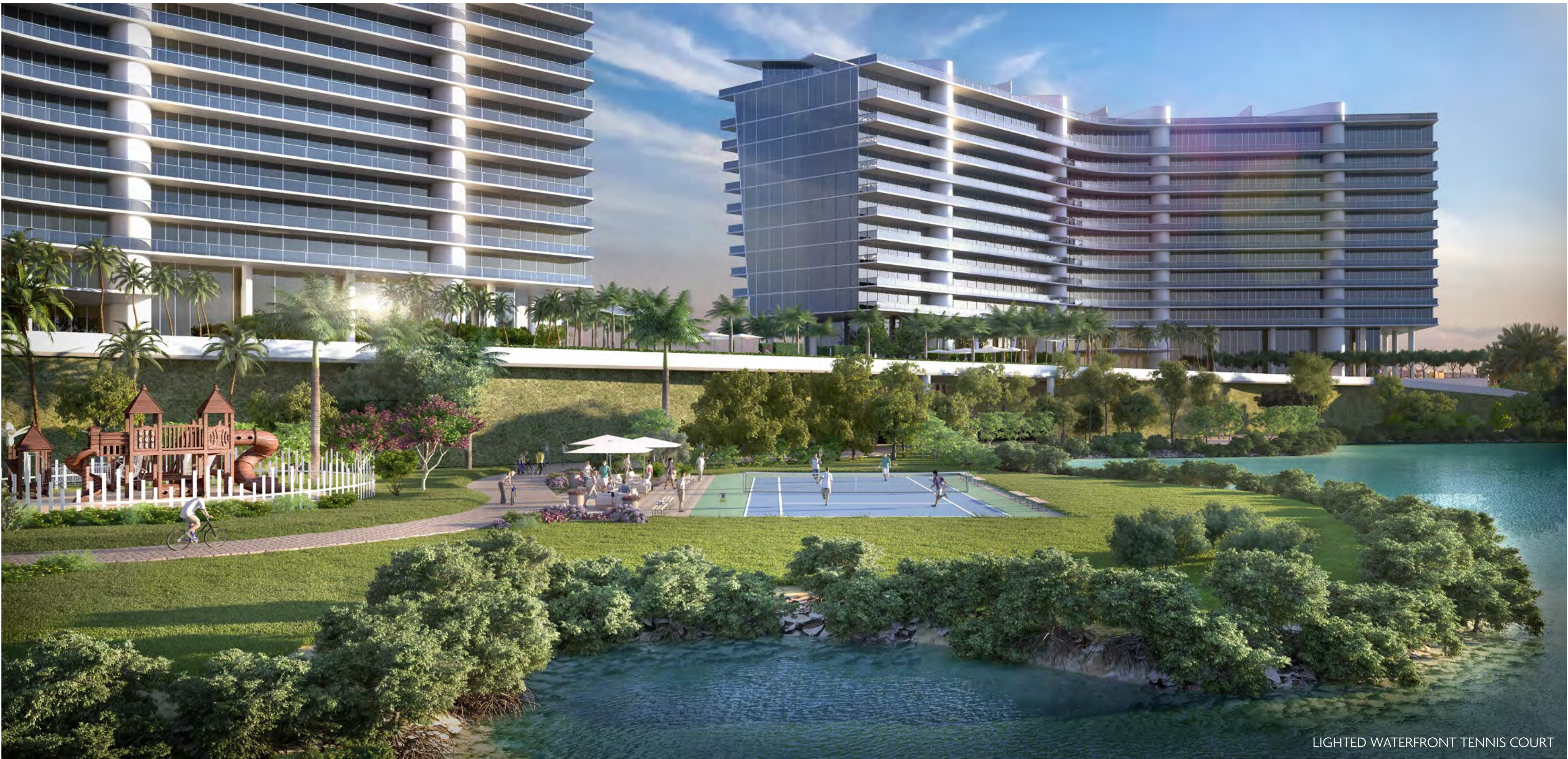
LIGHTED WATERFRONT TENNIS COURT