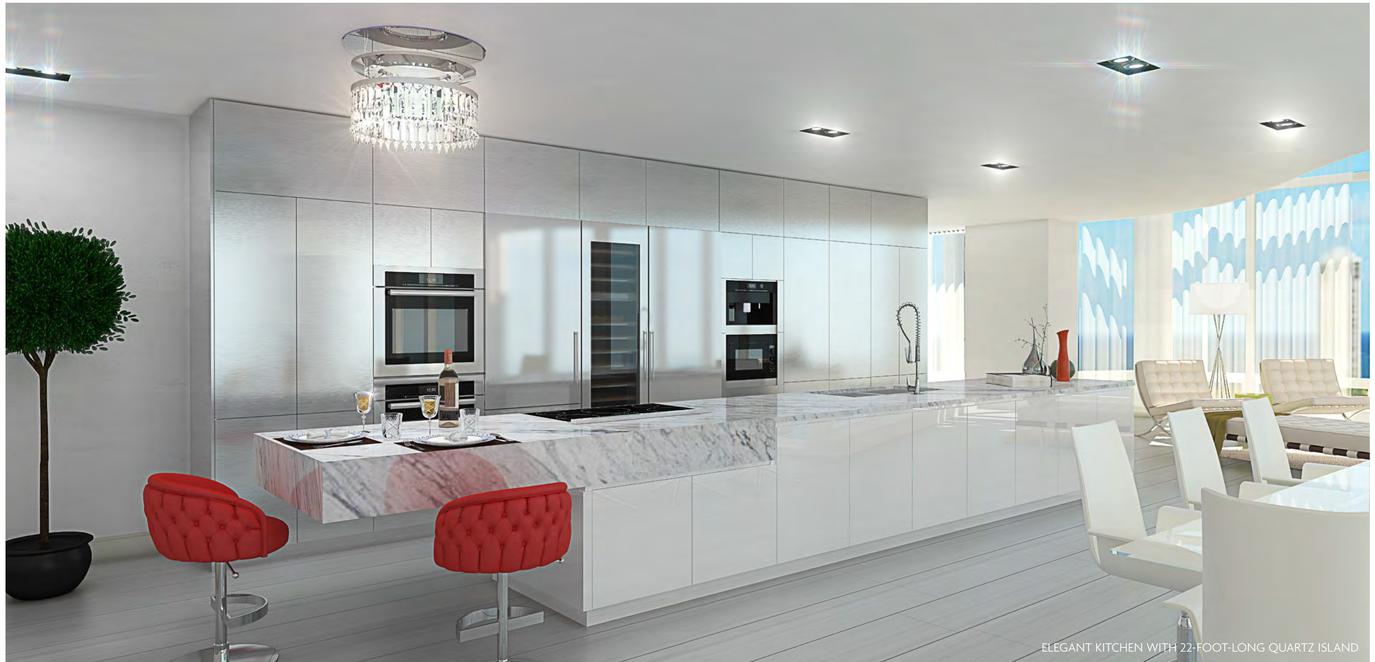
ELEGANT KITCHEN WITH 22-FOOT-LONG QUARTZ ISLAND