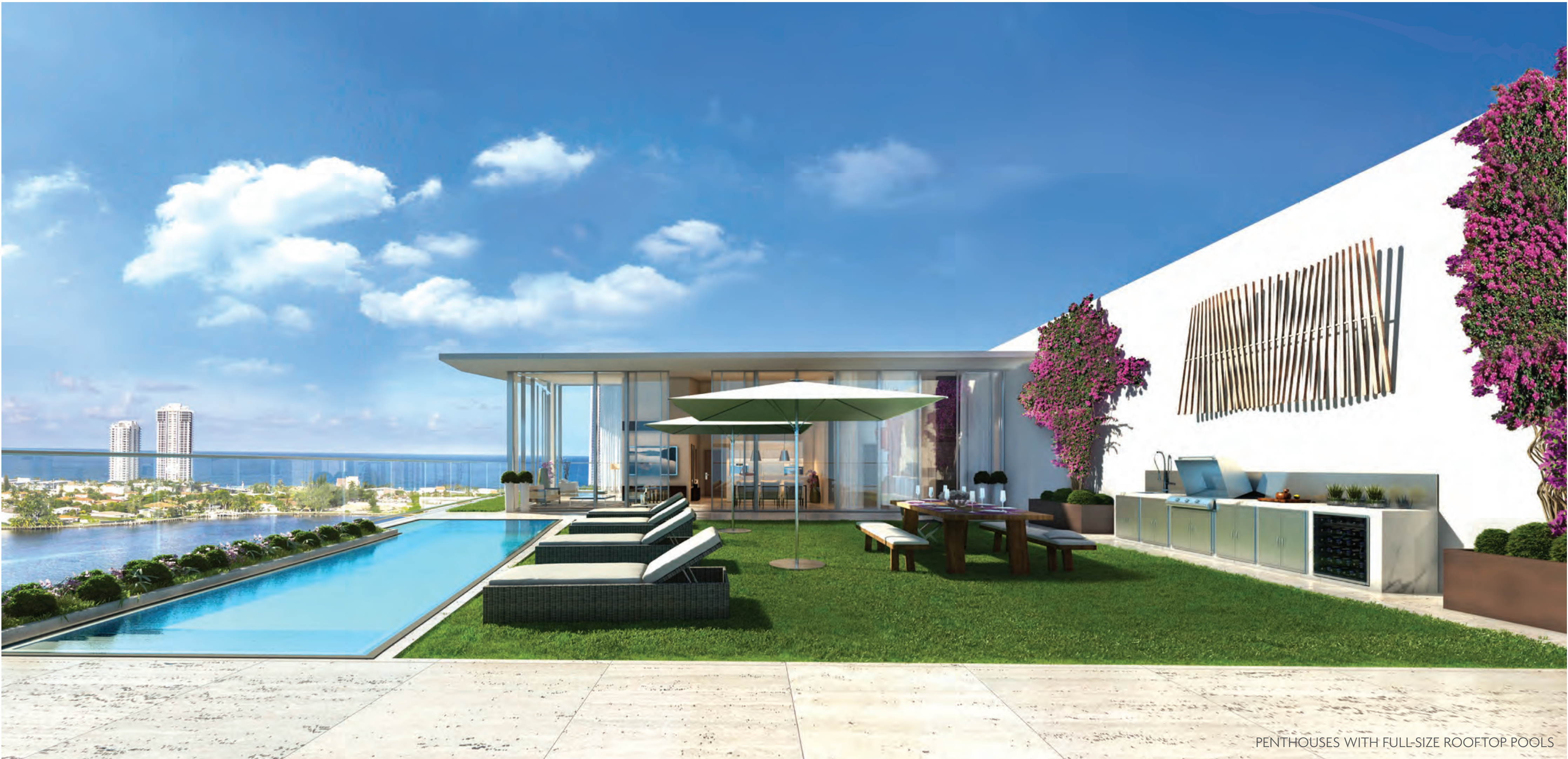
PENTHOUSES WITH FULL-SIZE ROOFTOP POOLS