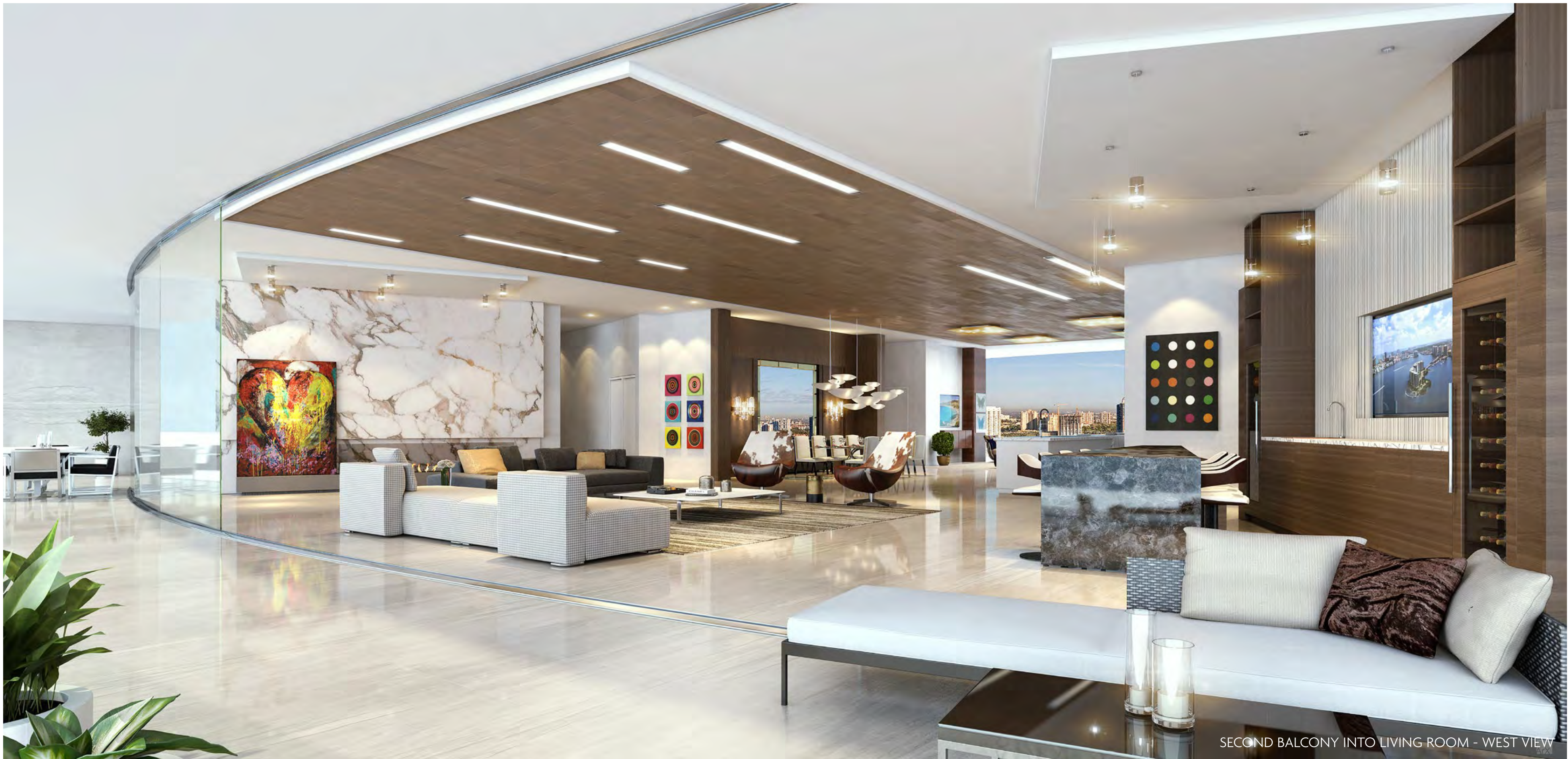
SECOND BALCONY INTO LIVING ROOM - WEST VIEW