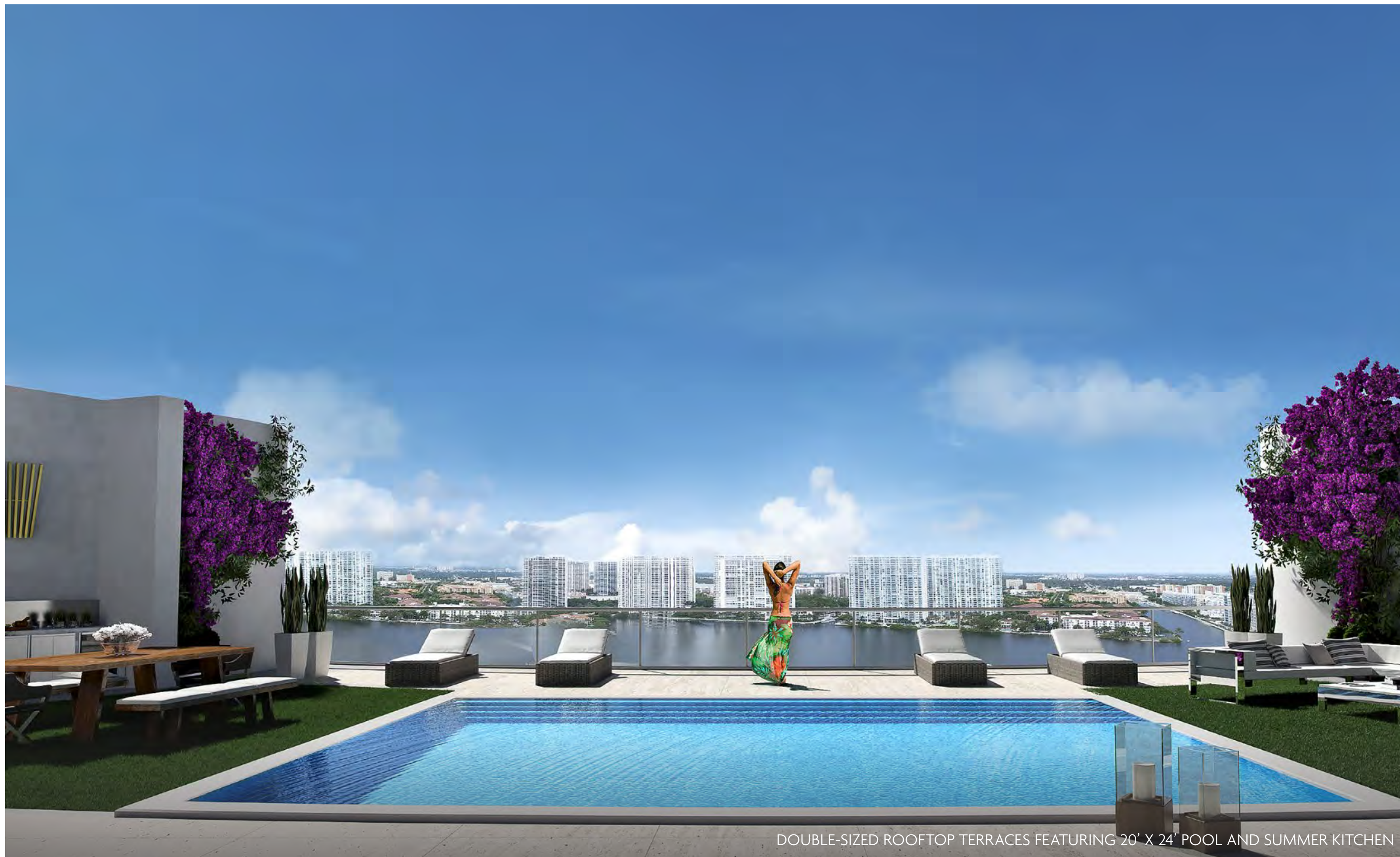
DOUBLE-SIZED ROOFTOP TERRACES FEATURING 20' X 24' POOL AND SUMMER KITCHEN