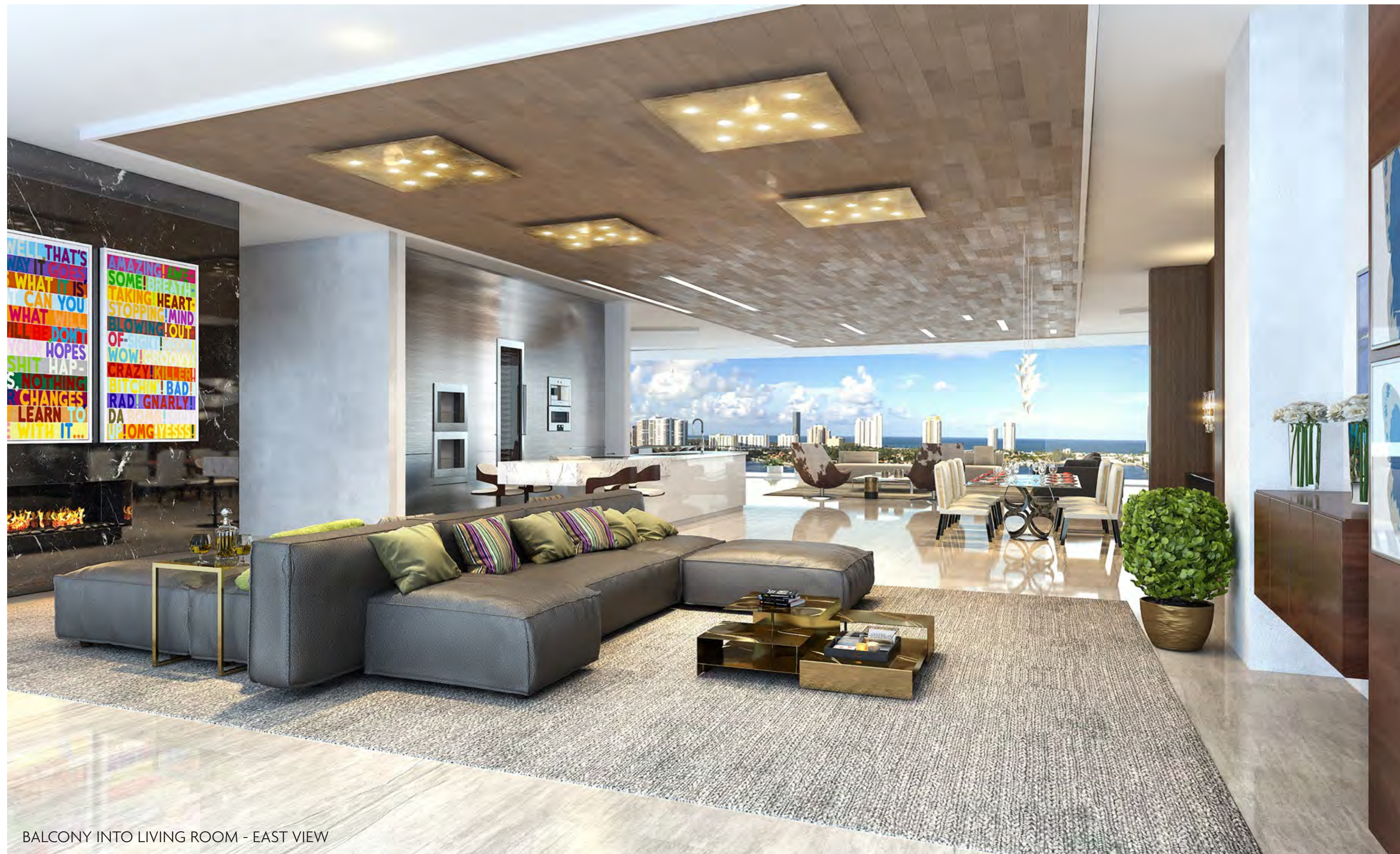
BALCONY INTO LIVING ROOM - EAST VIEW